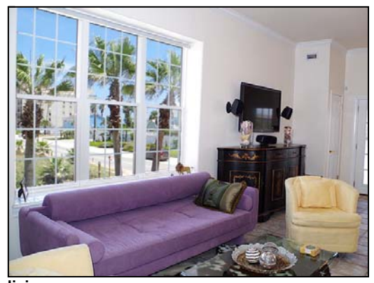
living second living area has ocean view