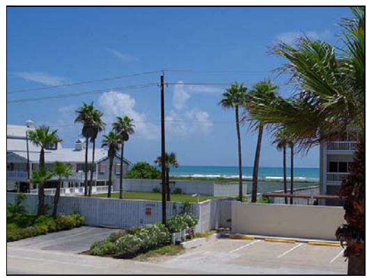
2nd floor view ocean view from 2nd floor balcony