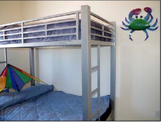
guest bedroom 2 guest bedroom #2 on first floor