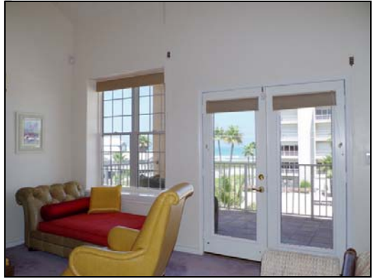
master sitting area master bedroom has sitting area with Gulf view