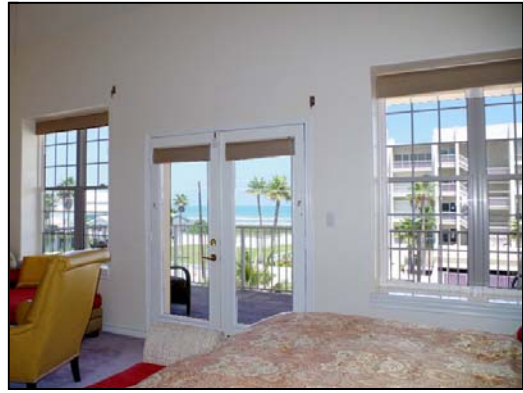
master gorgeous ocean views from the master bedroom