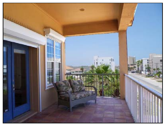
3rd floor balcony east and north views from the 3rd floor balcony