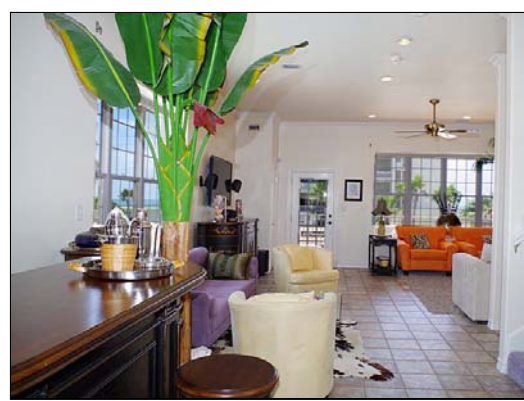
living open concept