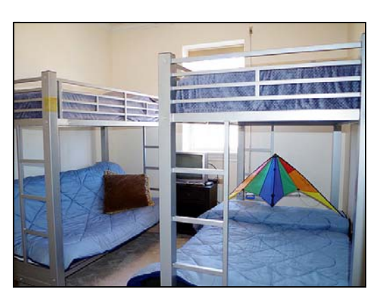
guest bedroom 2 guest bedroom #2 on first floor