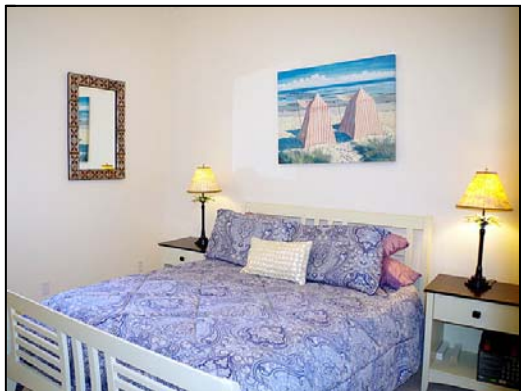
guest bedroom 1 guest bedroom #1 on first floor