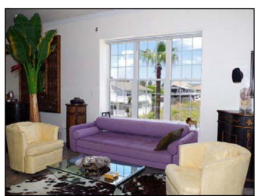
living second living area