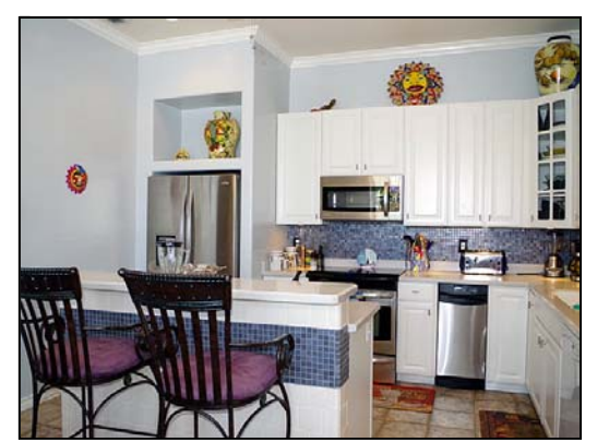
kitchen stainless steel applianes