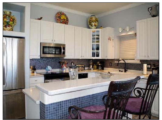
kitchen plenty of cabinets