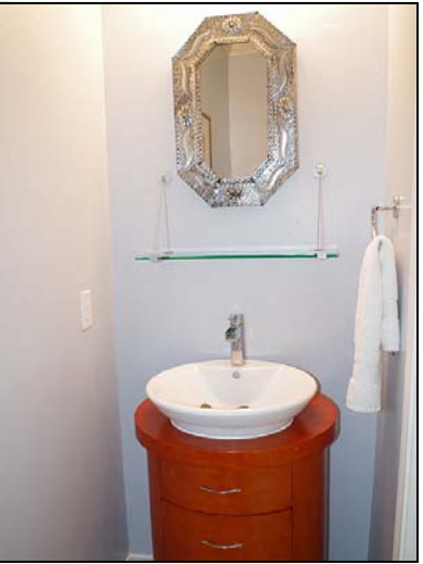
half bath half bath on main (2nd floor)