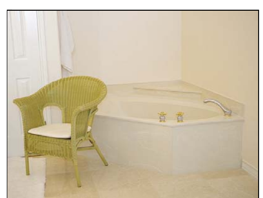
master bath jetted tub in master bath