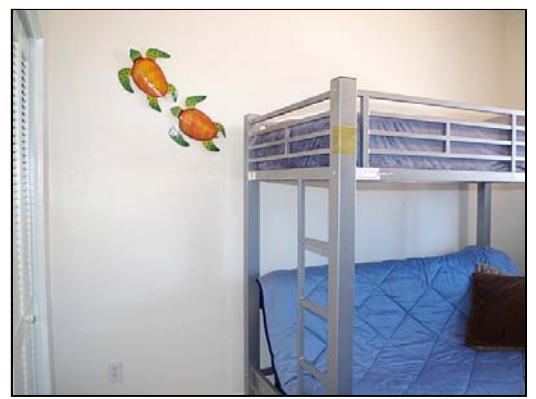
guest bedroom 2 guest bedroom #2 on first floor