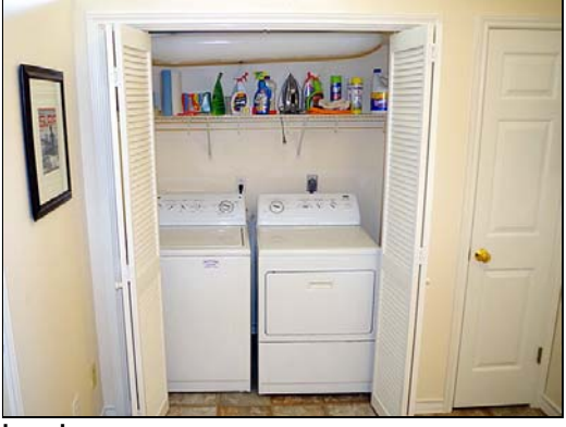
laundry laundry on first floor