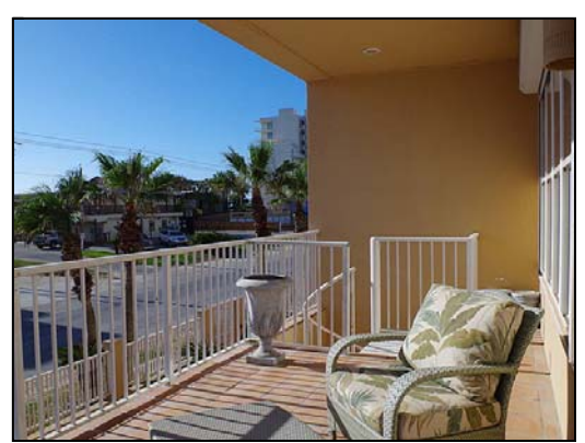
2nd floor balcony 2nd floor balcony is accessible from living area