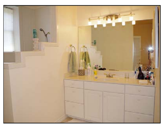
master bath dual sinks in master bath