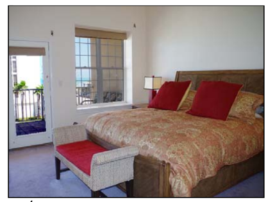
master master bedroom has balcony access