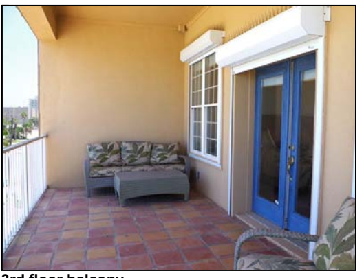
3rd floor balcony 3rd floor balcony is accessible from the master bedroom