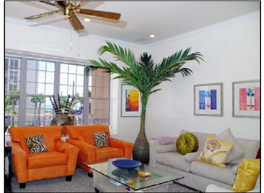
living living area has ocean view