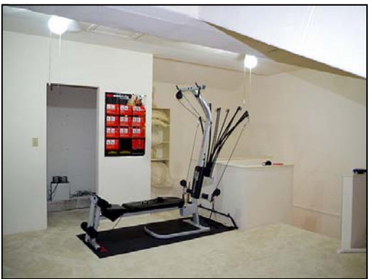
4th floor attic 4th floor flex space