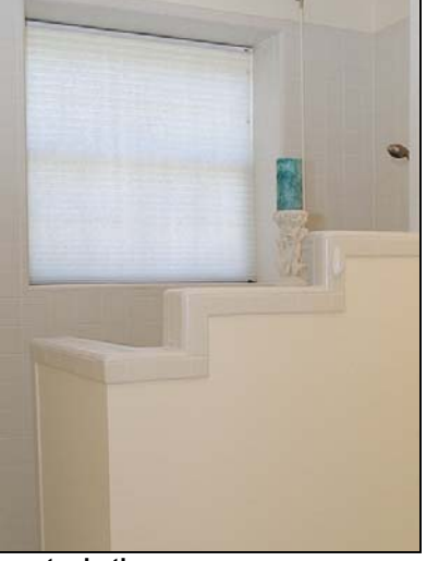
master bath separate walk-in shower in master bath