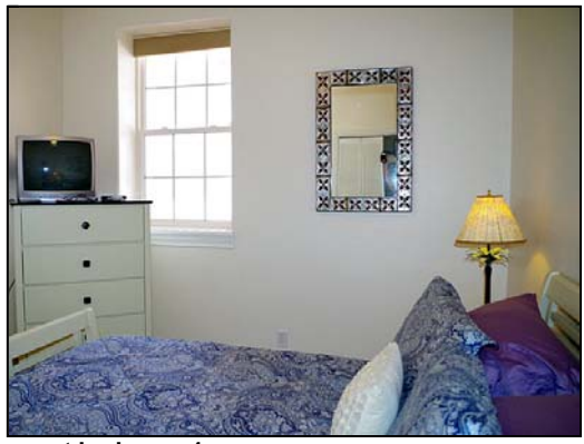
guest bedroom 1 guest bedroom #1 on first floor