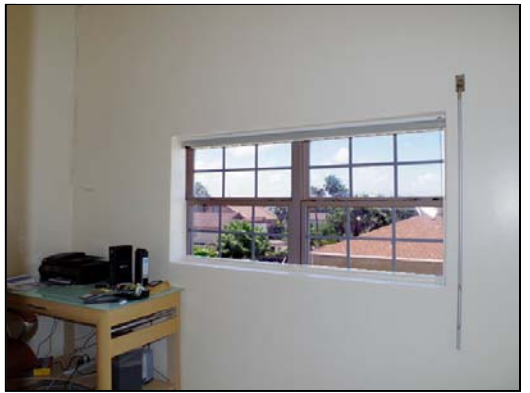
office office on the 3rd floor