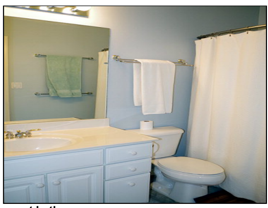
guest bath full bath on first floor shared by two guest bedrooms