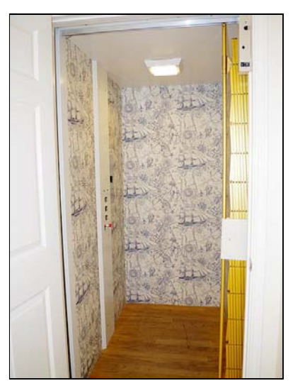
elevator private elevator