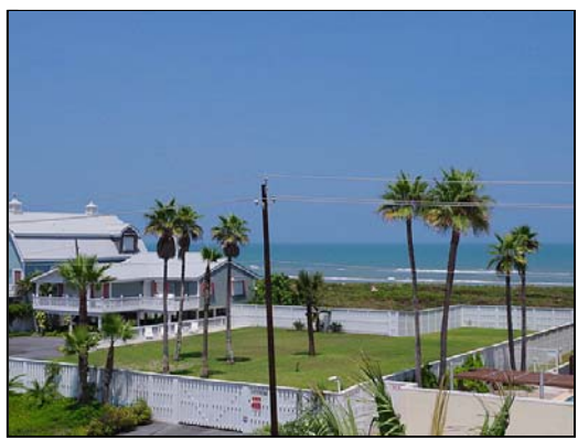
view 3rd floor this could be your view!