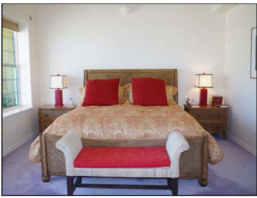
master very spacious master with vaulted ceilings