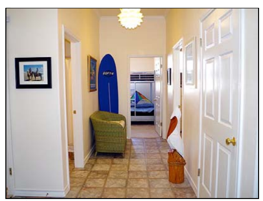
1st floor entry first floor foyer