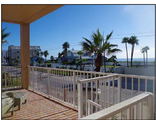
2nd floor balcony 2nd floor balcony has ocean view