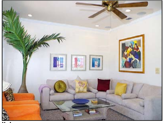
living bright, tropical decor