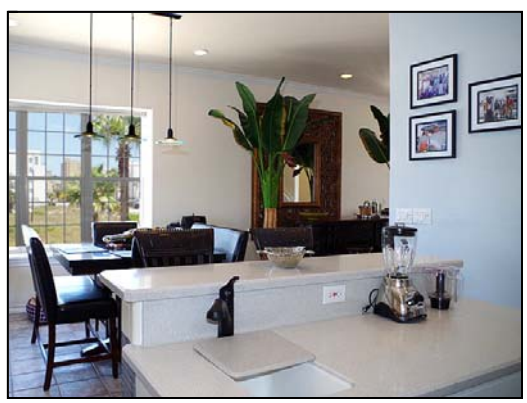
kitchen/dining kitchen island with sink