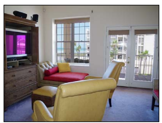
master sitting area master bedroom has sitting area with Gulf view