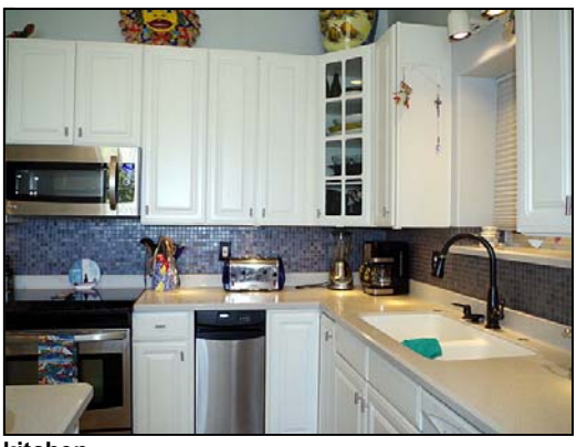
kitchen tile backsplash