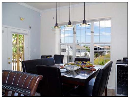
dining dining has view of pool