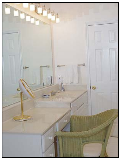
master bath master bath his/hers sinks with vanity