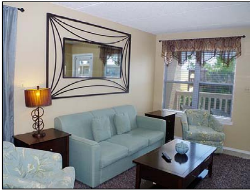
living Living area has sleeper sofa.