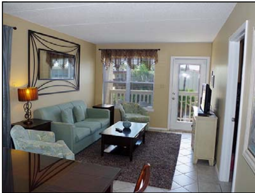
living Selling full furnished!