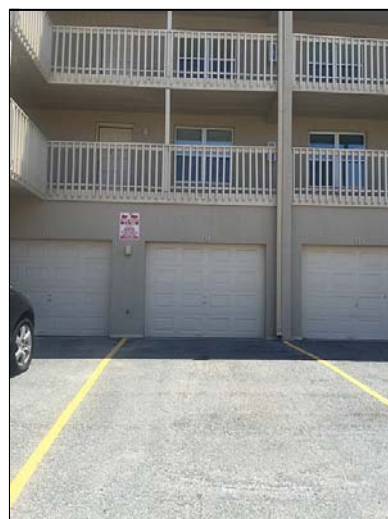
garage One-car garage!!!