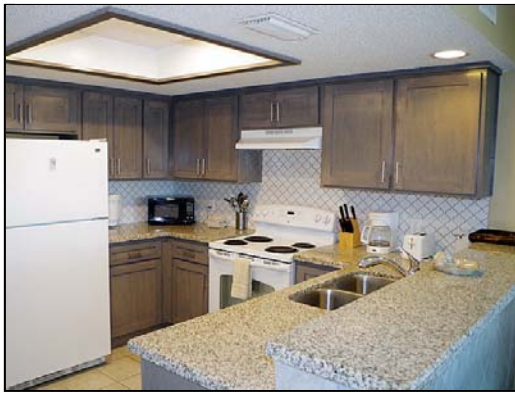
kitchen Kitchen has been updated with granite counters and tile backsplash.