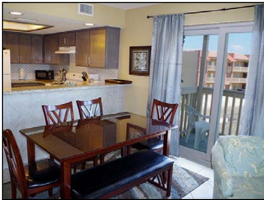
dining Dining space for six.