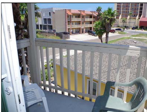
balcony 2 This corner unit has an extra balcony.