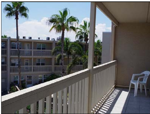
balcony 1 South facing balcony.