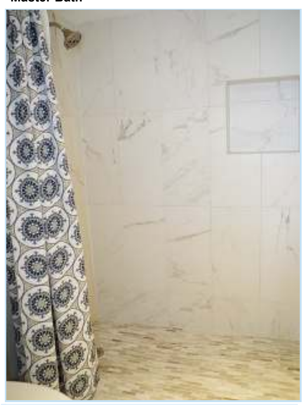
new custom tiled walk-in shower