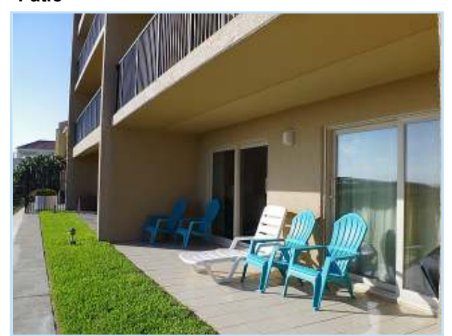
patio with ocean view