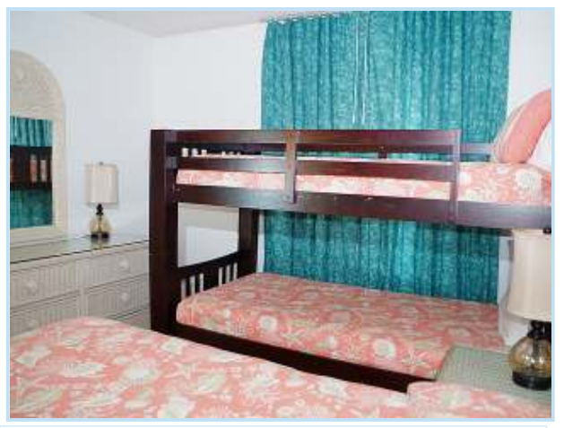
guest bedroom sleeps 4