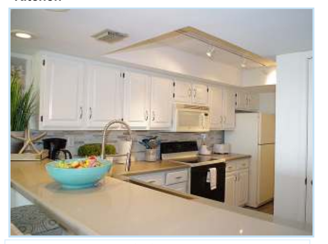
gorgeous new countertops