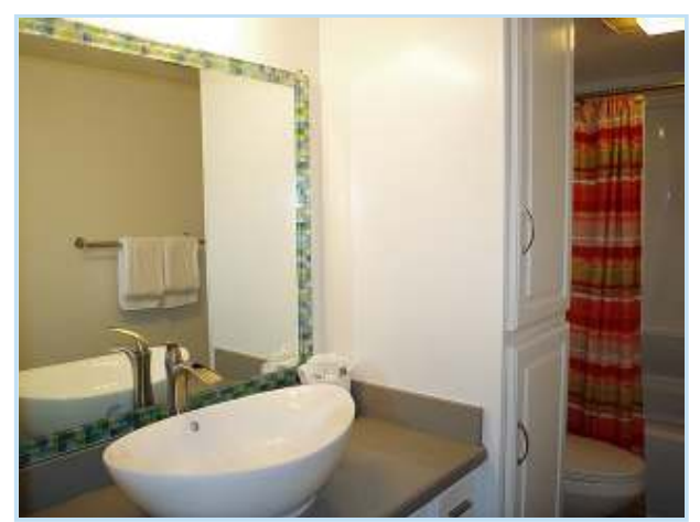
new countertop and sink