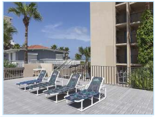
west-facing sundeck above pool