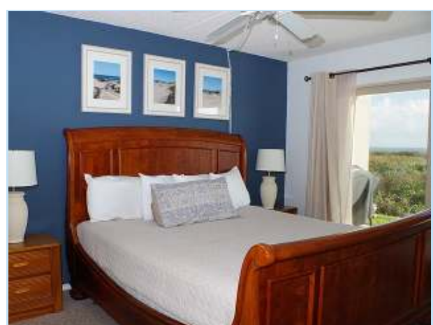
all new furniture in master bedroom