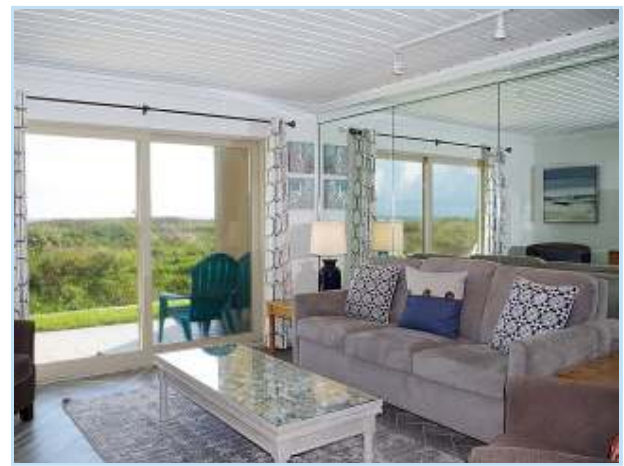
mirror doubles the ocean view