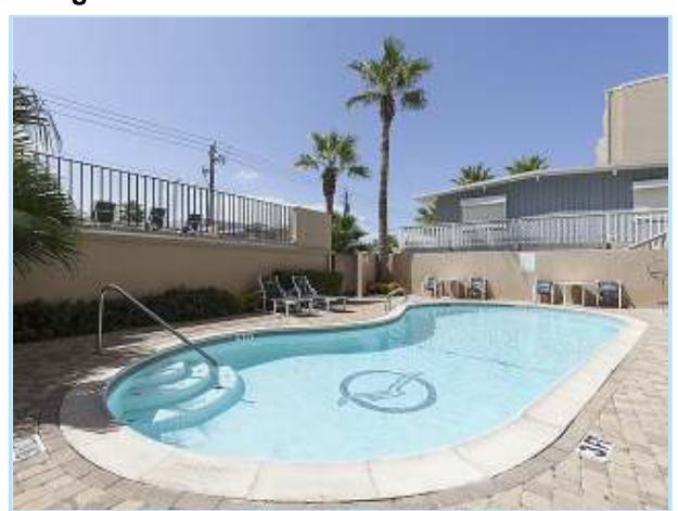
Seagull pool is heated