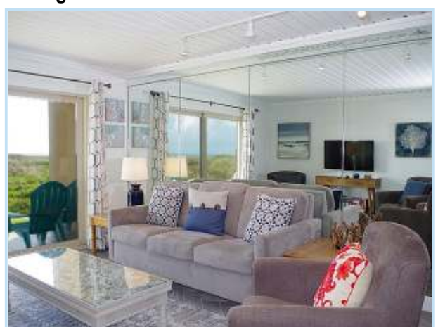
all new furniture in living room