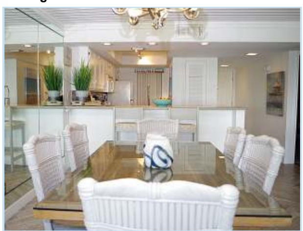
seating for 6