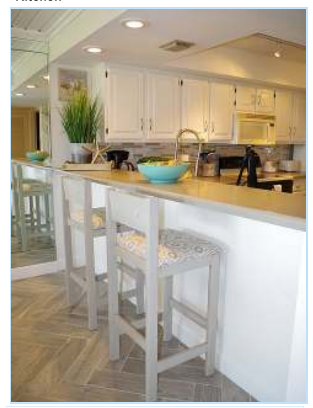
additional seating at kitchen counter