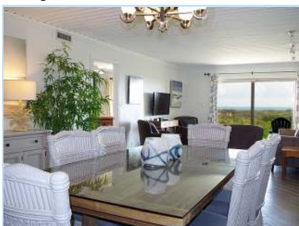
all new furniture in dining room