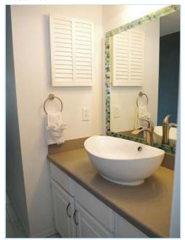
new countertop and sink