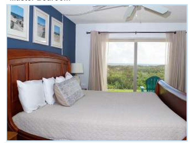
access to patio from master