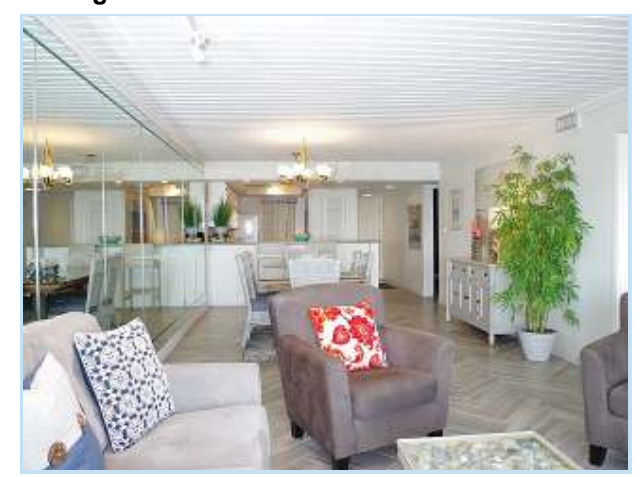
herringbone pattern tile