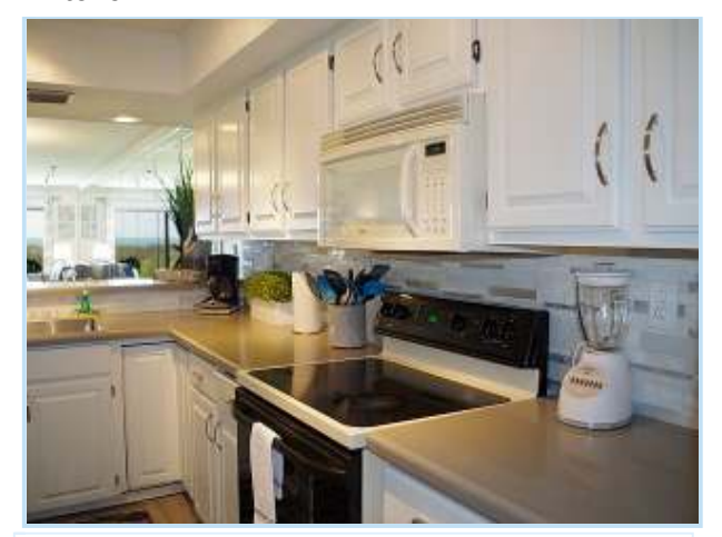
all new custom cabinets