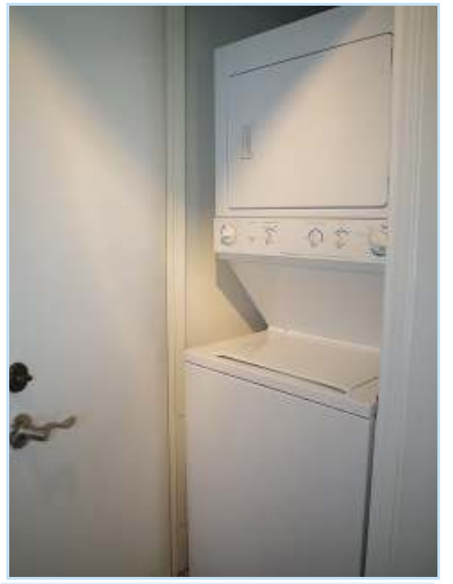
convenient in-unit washer/dryer