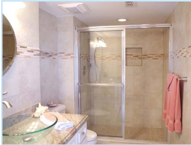
classy bowl sink