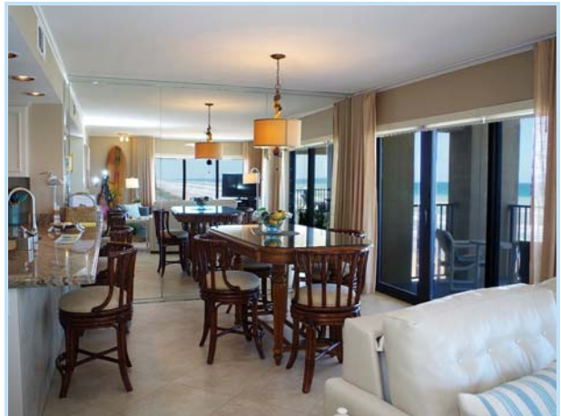
extra seating at kitchen island