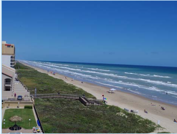
unobstructed beach view from balcony