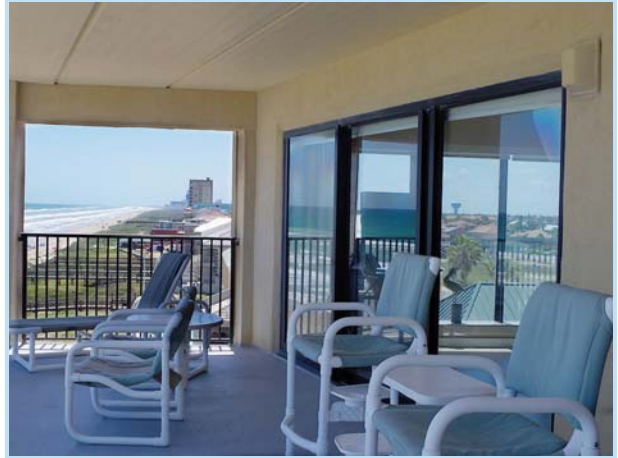
corner unit provides south view