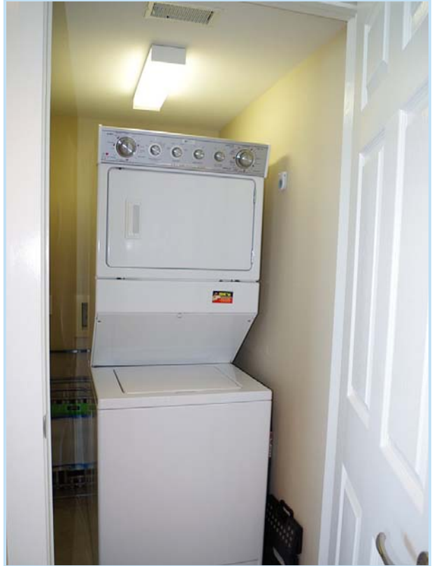
convenient in-unit washer/dryer