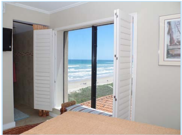
wake up to this view