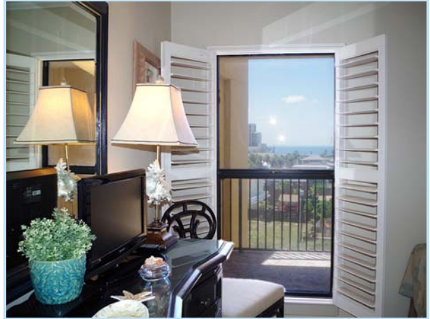
guest bedroom has view of the bay