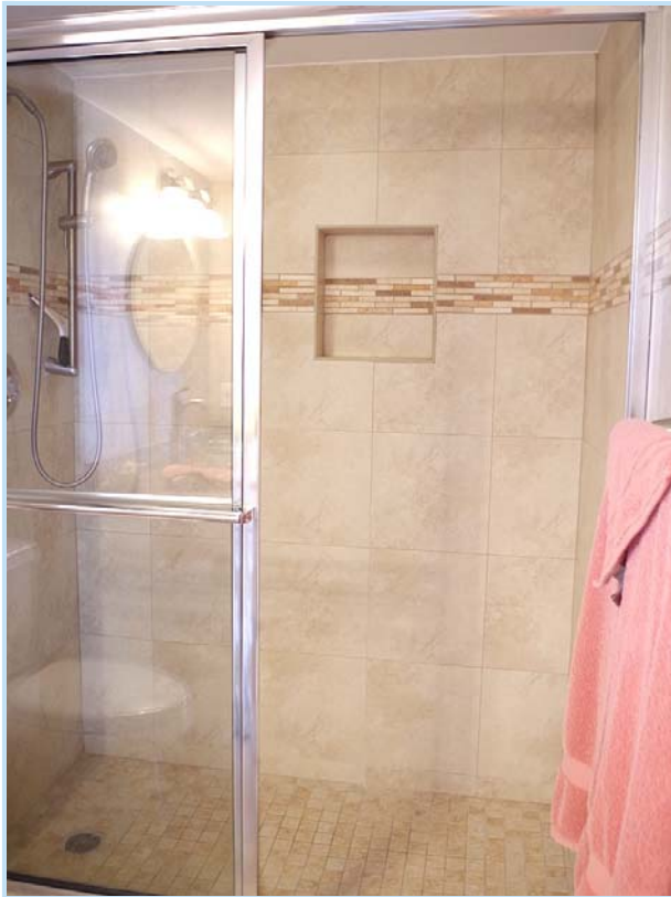
custom tiled walk-in shower