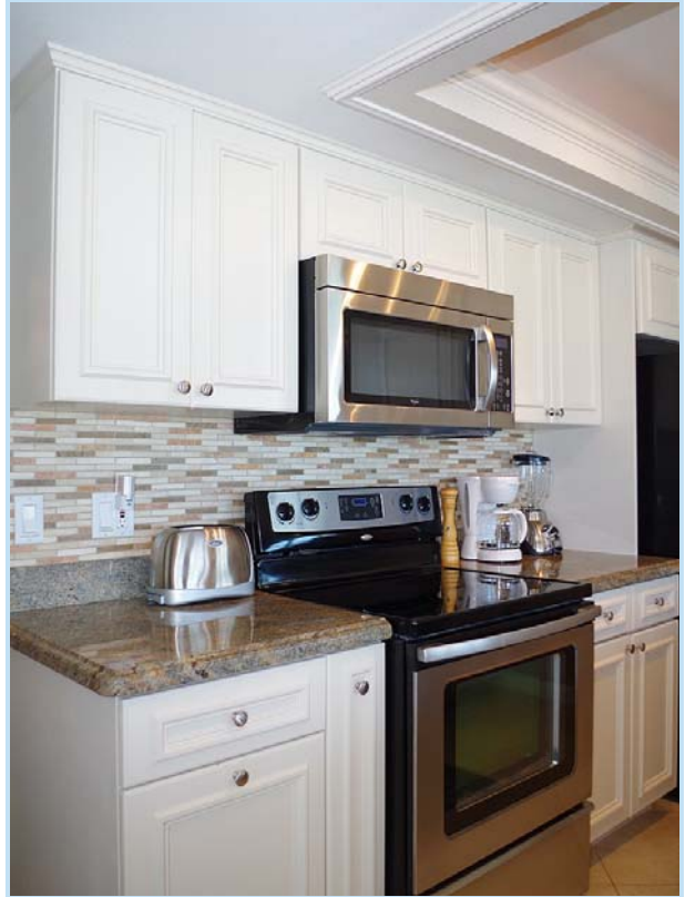
custom tile backsplash