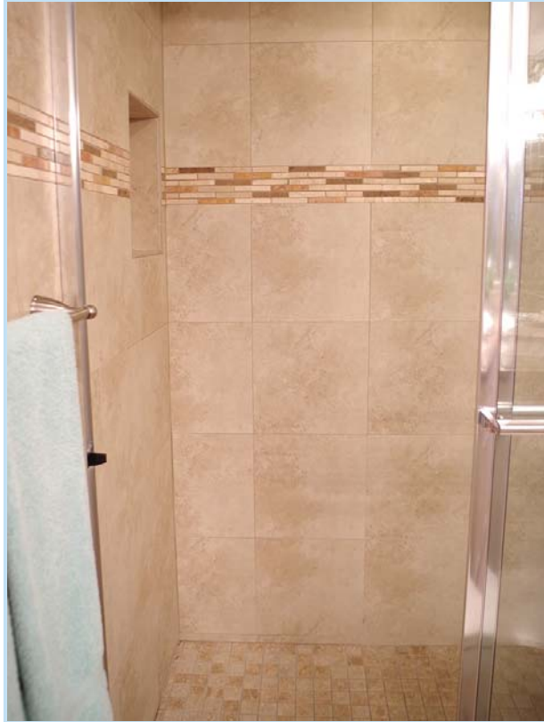
custom tiled walk-in shower