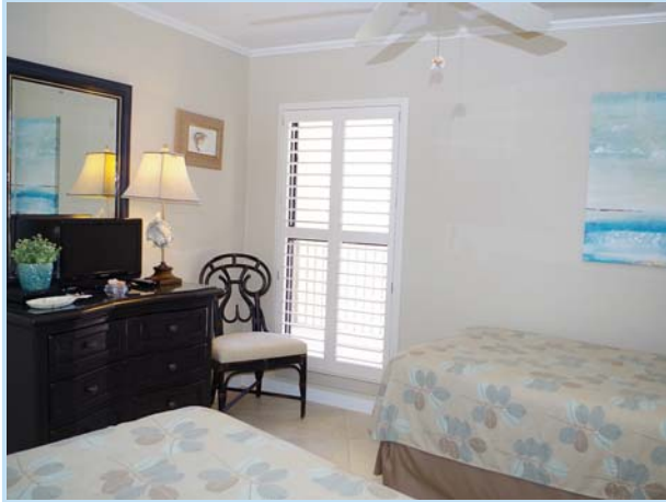
spacious guest room