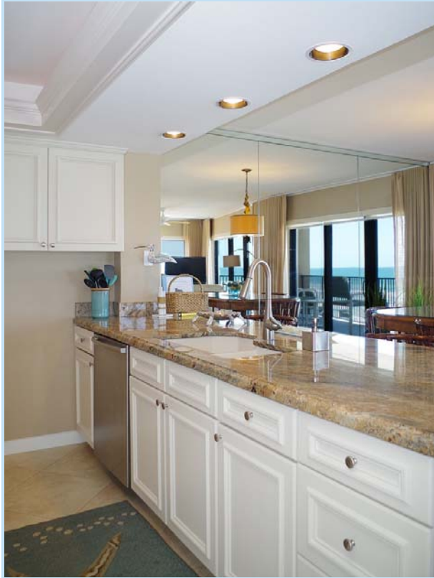
plenty of cabinet space