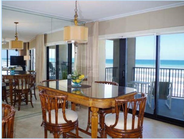
mirrors double the view