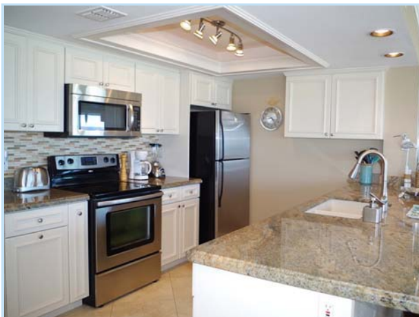
stainless steel appliances