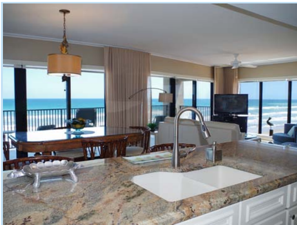
gorgeous granite counters