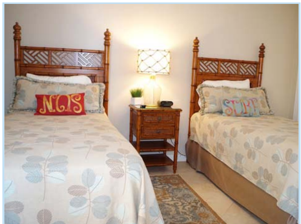
guest bedroom accommodates 2 twin beds