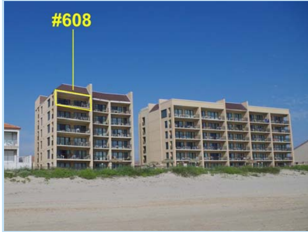
#608 is on the south corner