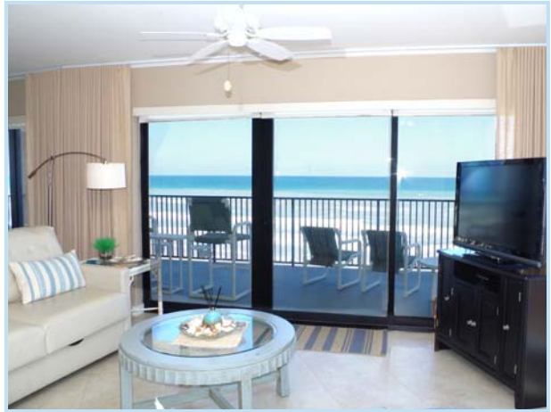
floor-to-ceiling water view