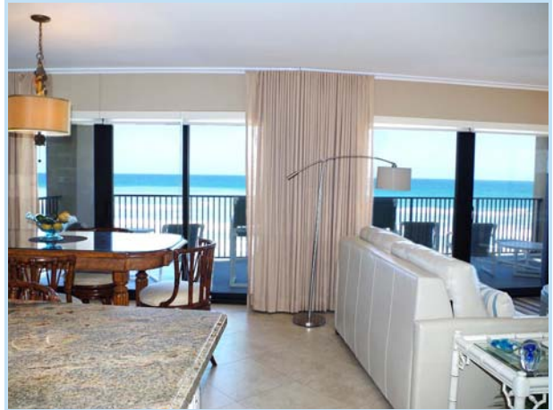
selling fully furnished