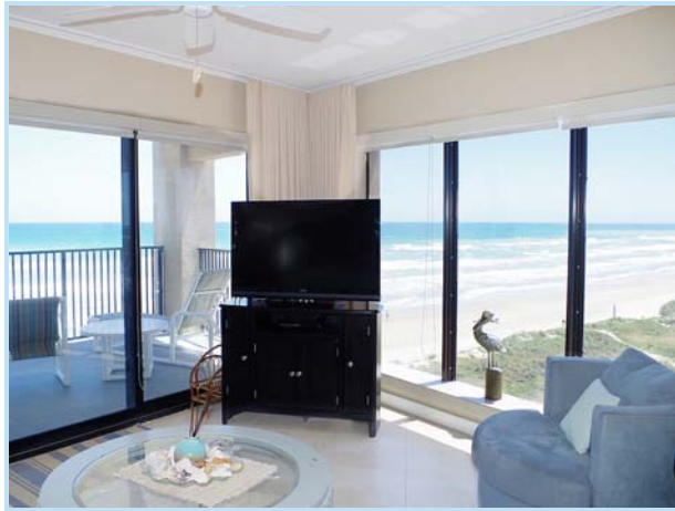
view from living area