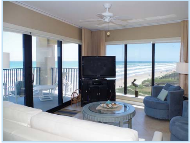
south corner location has extra windows with amazing view