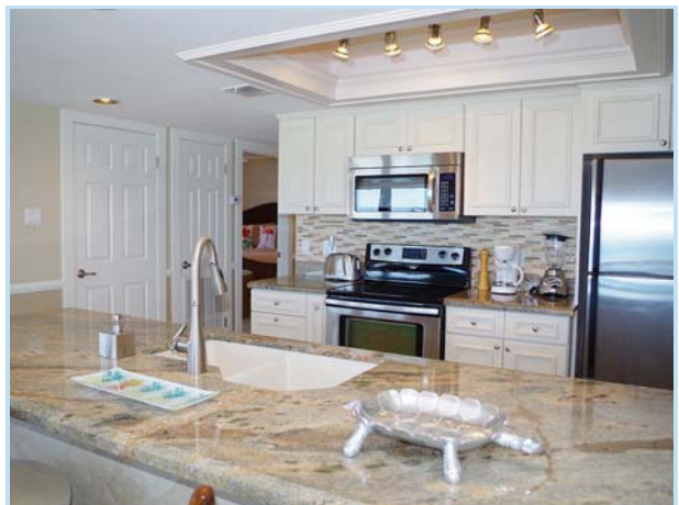
huge kitchen island