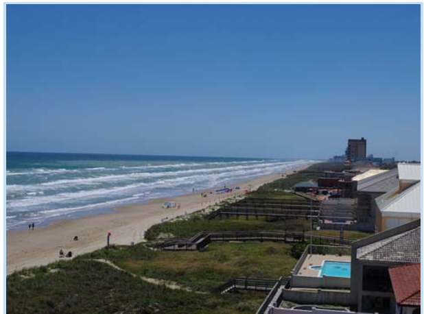
unobstructed beach view from balcony