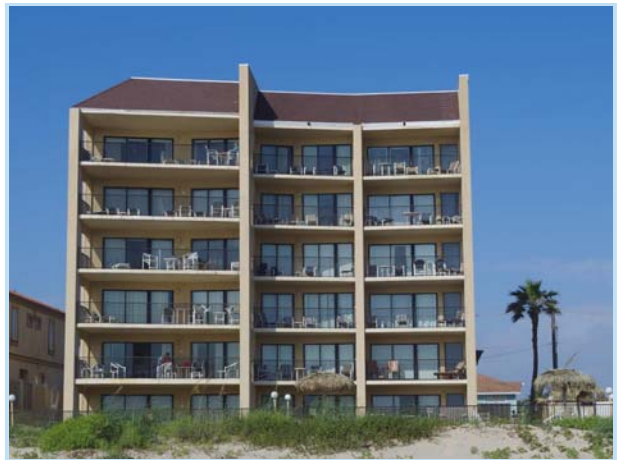
right on the beach