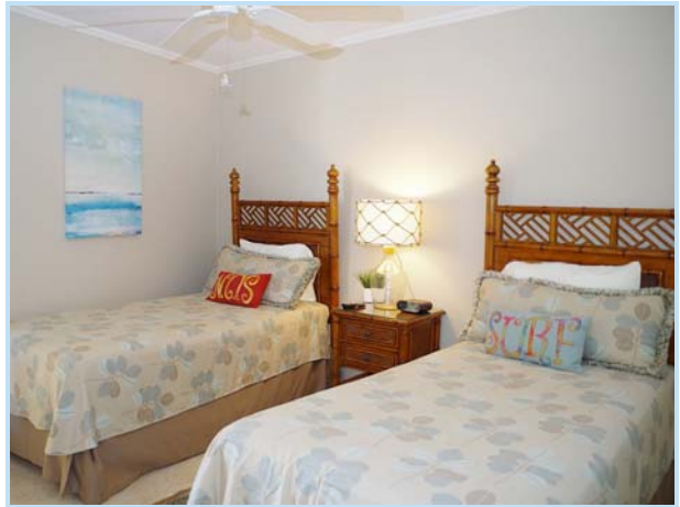
selling fully furnished