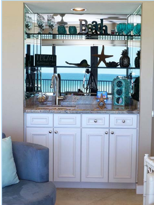
convenient wetbar in living area