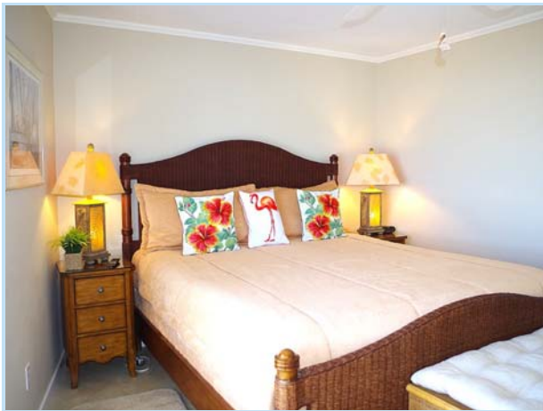
selling fully furnished