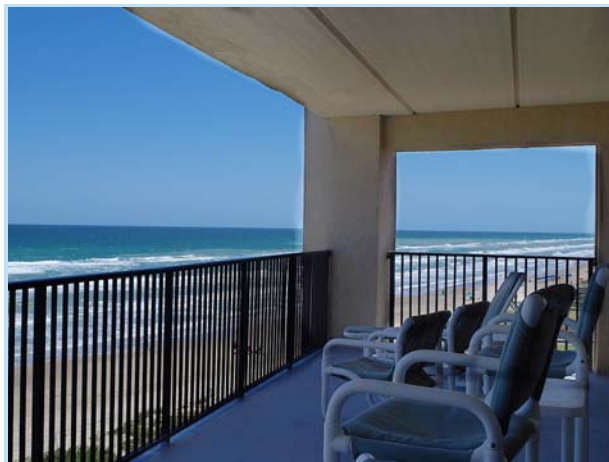
east and south views