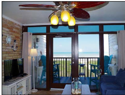
living Living room has ocean view.