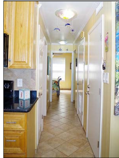
hallway Two bedrooms, one bath, and two closets are accessible from the hallway.