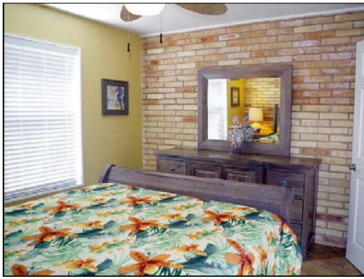
bedroom 1 Brick accent wall in bedroom.