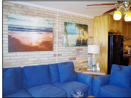
living All living area furnishings included with sale.