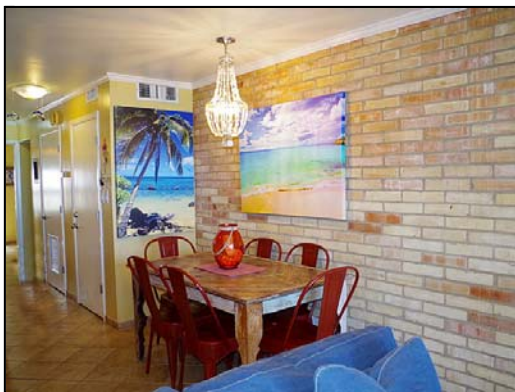
dining Open concept dining and living.