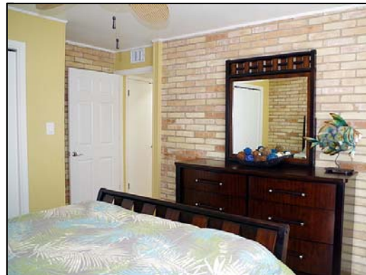
bedroom 2 All bedroom furnishings included with sale.