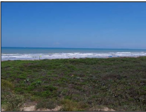
view from balcony This could be your view!