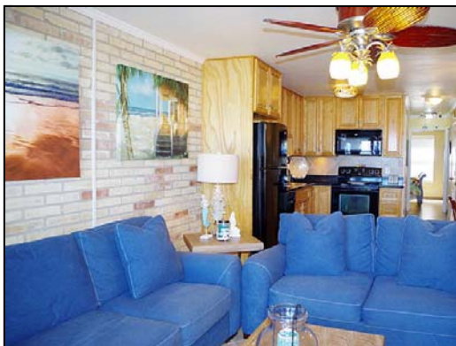
living Plenty of seating for family and friends.