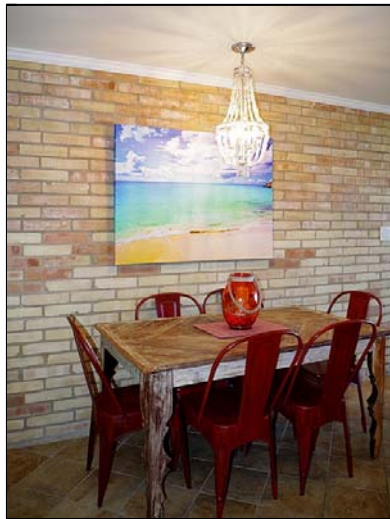
dining Chandelier in dining area.