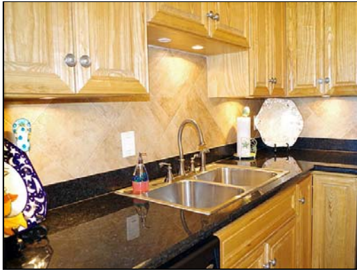
kitchen Granite counters and tile backsplash.