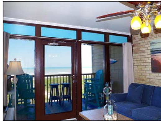
living Balcony runs the width of the condo.