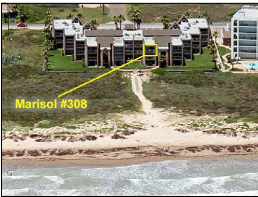
aerial Unit #308 is one of the closest to the beach.