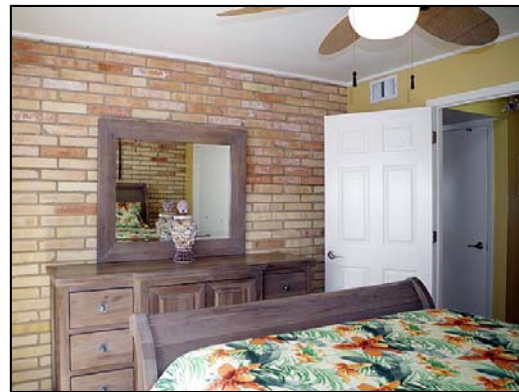
bedroom 1 All bedroom furnishings included with sale.