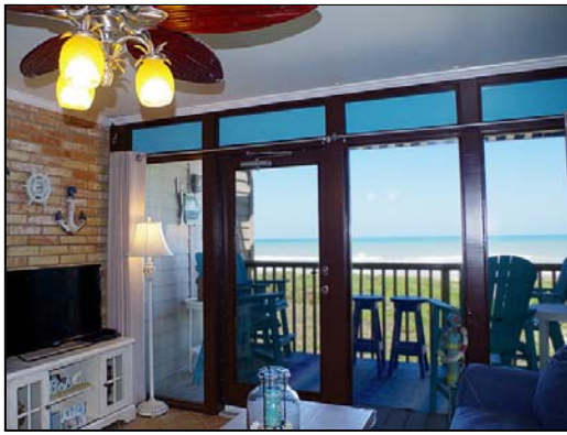
living Sit on the couch and watch the waves.