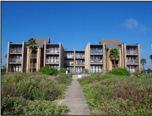
exterior Marisol from the beach side.