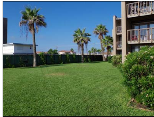
lawn & BBQ Green space has BBQ and picnic benches.