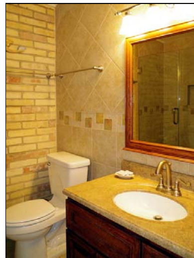
bath Updated sink, cabinet, and lighting.