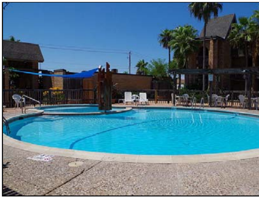
pool Marisol pool.