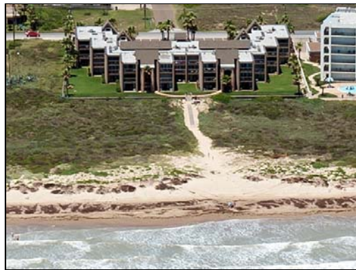
aerial Beachfront living at Marisol!