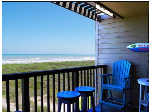
balcony Sit on the balcony and watch the waves roll in.