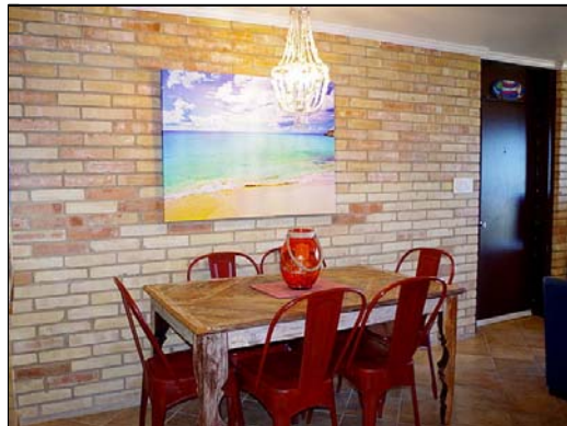
dining Brick accent wall in dining room.