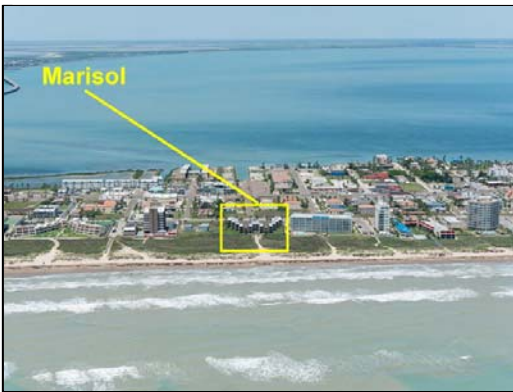
aerial Marisol is located directly on the beach!