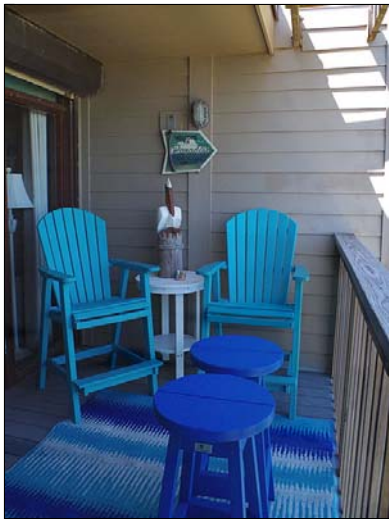
balcony Private balcony.