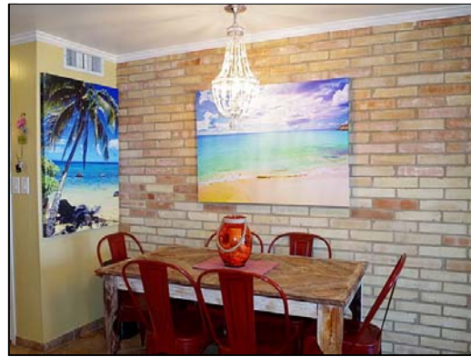
dining Spacious dining area.