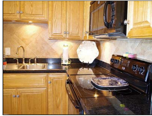
kitchen All appliances included with the sale.