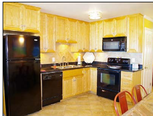
kitchen Spacious kitchen.