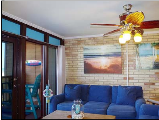
living Brick accent wall in living area.