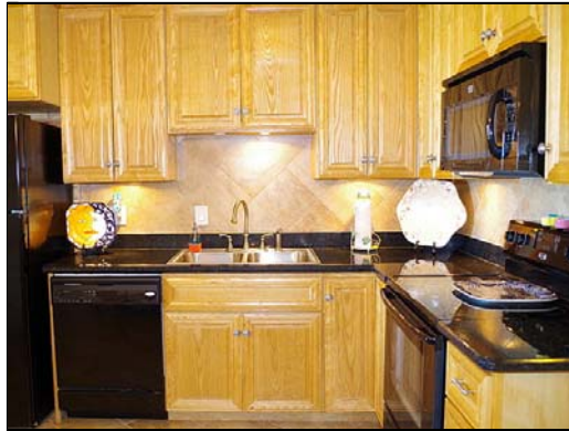
kitchen Kitchen has plenty of cabinet space.