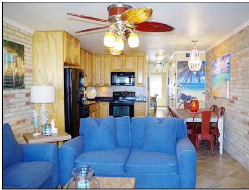
living Open concept.