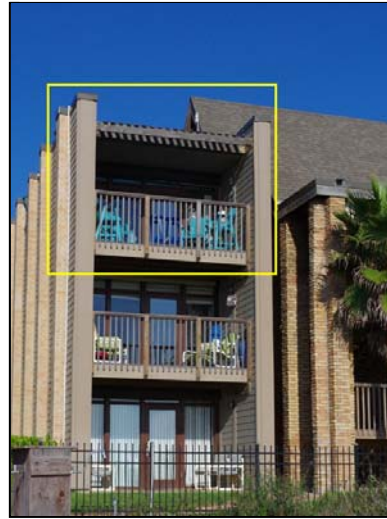
exterior Top floor.