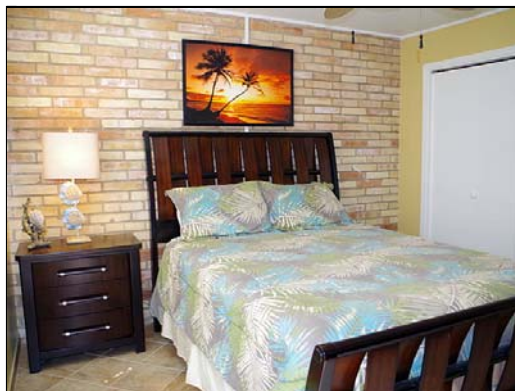
bedroom 2 Ample closet space.