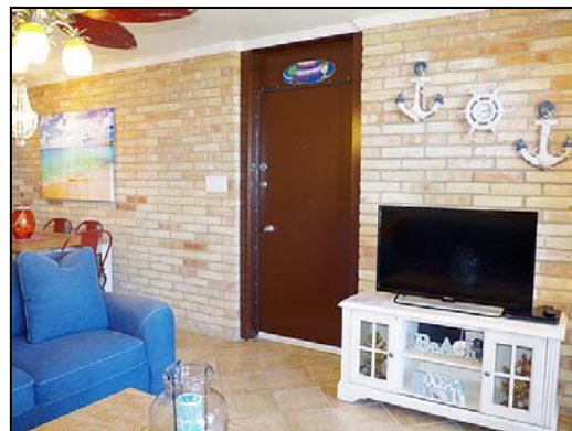
entry All electronics included with the sale.