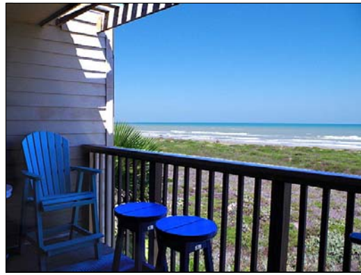
balcony Unobstructed view from the balcony.