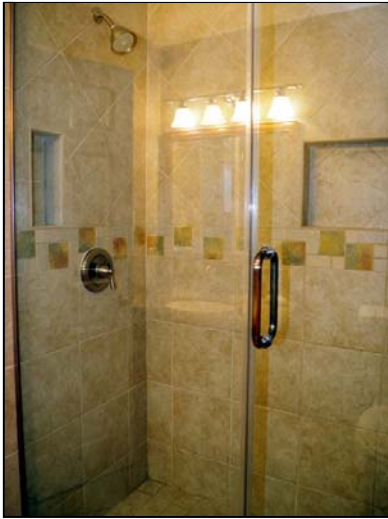
bath Custom tiled walk-in shower.