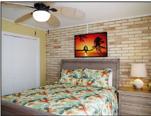
bedroom 1 Ample closet space.