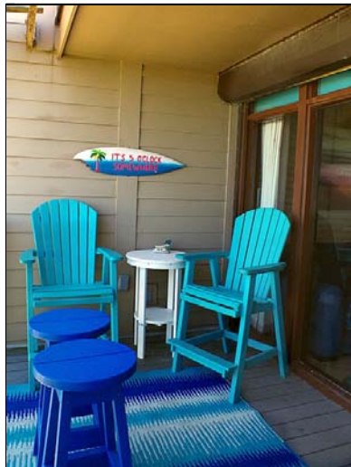
balcony Balcony runs the width of the condo.