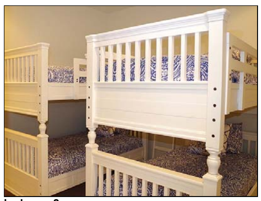
bedroom 2 bedroom 2 has room for plenty of guests