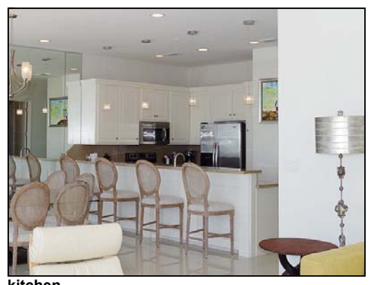
kitchen open concept