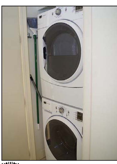
utility convenient in-unit washer/dryer