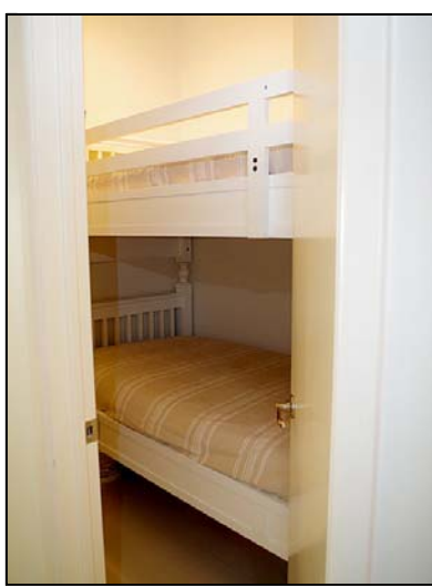
nanny's rm nanny's or housekeeper's room