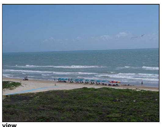
view view from balcony