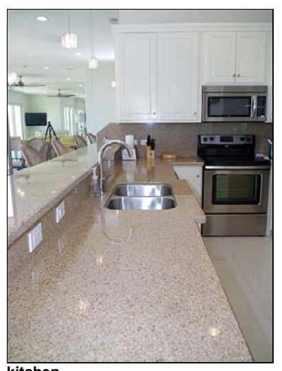
kitchen granite counters