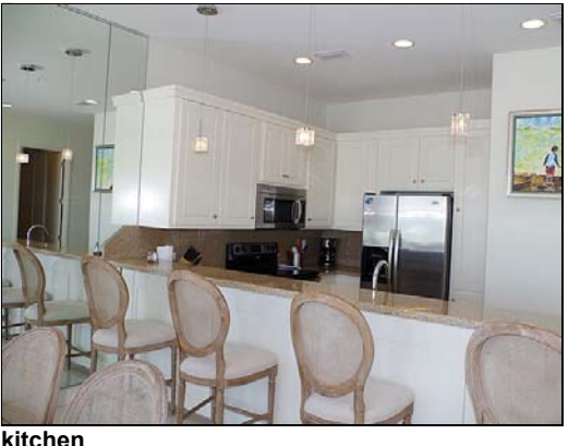
kitchen plenty of seating