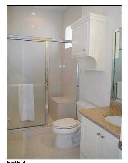
bath 1 bath 1 is connected to bedroom 1