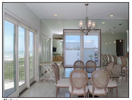
dining great water views from the dining area