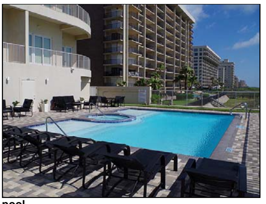
pool Las Olas pool