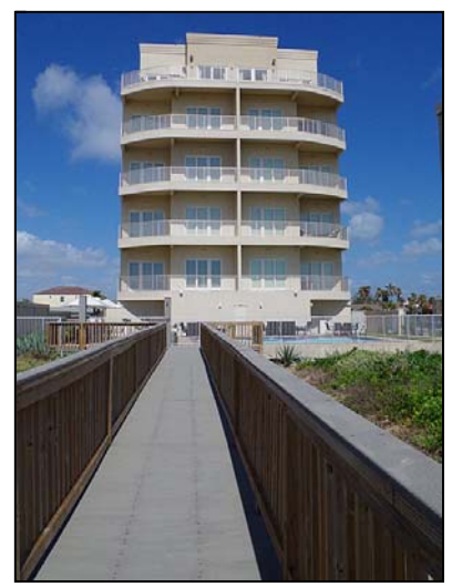
walkway to beach Las Olas private beach walkway