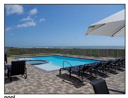
pool Las Olas pool