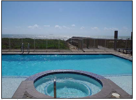
hot tub Las Olas pool & hot tub