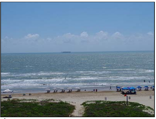
view view from balcony