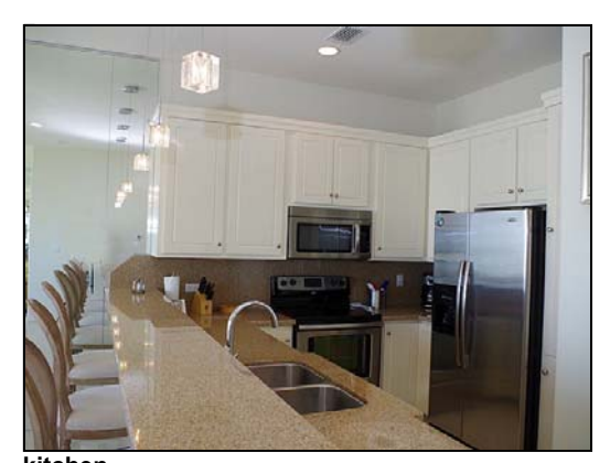
kitchen stainless steel appliances