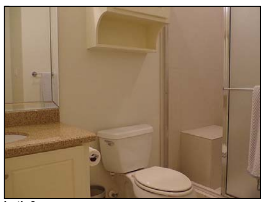
bath 3 bath 3 is connected to bedroom 3