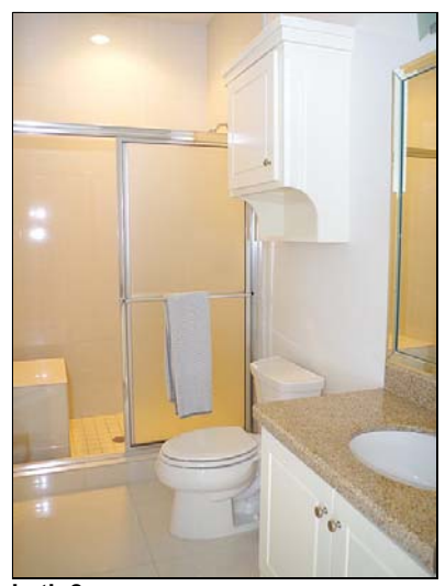
bath 2 bath 2 is accessible through bedroom 2 or hall