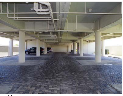
parking garage covered parking