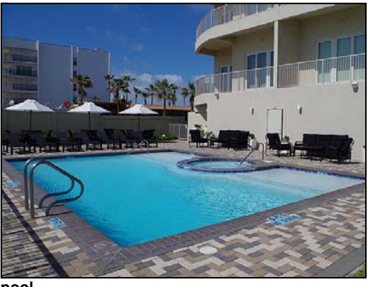
pool Las Olas pool