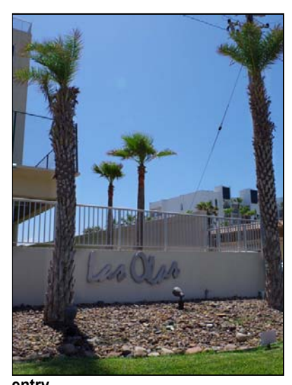
entry welcome to Las Olas