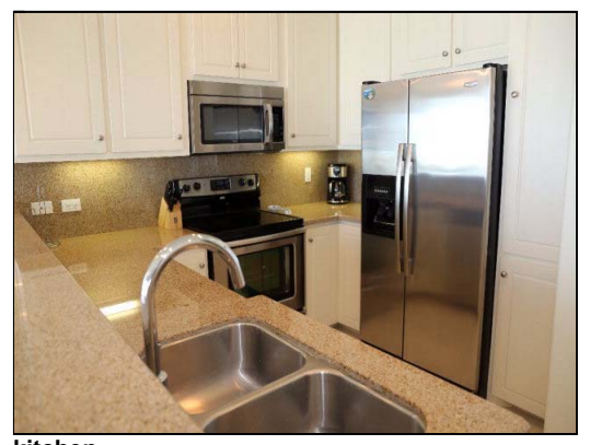
kitchen under cabinet lighting