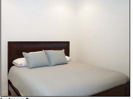
bedroom 3 bedroom 3