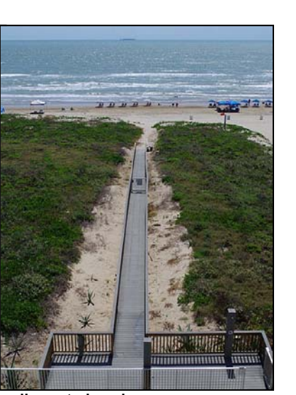
walkway to beach view of walkway to beach from unit 3301