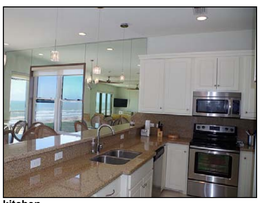
kitchen lots of cabinet space