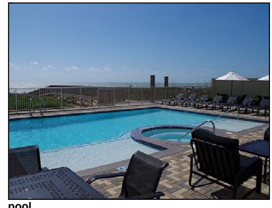
pool Las Olas pool