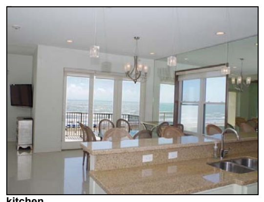
kitchen kitchen open to living and dining areas