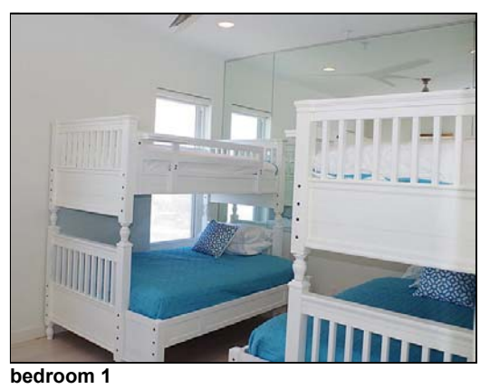
bedroom 1 has ensuite bath and south-facing windows