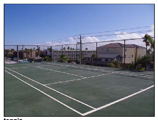
tennis Las Olas tennis