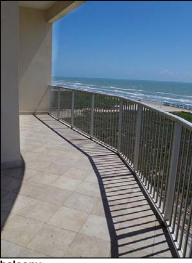
balcony over 200sqft of balcony space