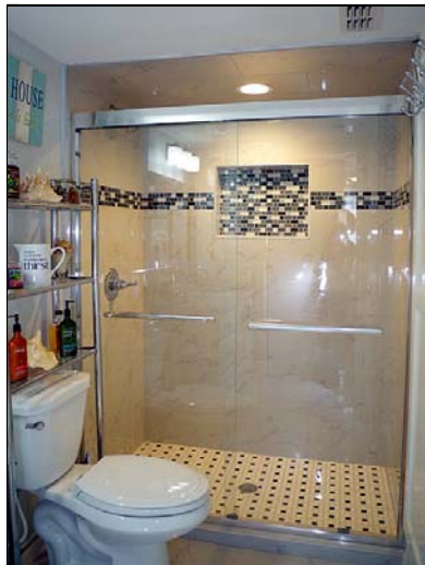
Master Bath Master bath has quartz countertop.