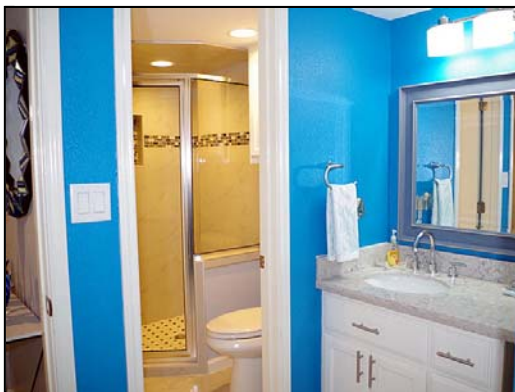
Guest Bath #1 Guest Bath #1 is connected to Guest Bedroom #1, giving this condo two master suites.