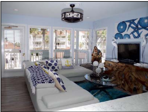
Living Living area leads to balcony.