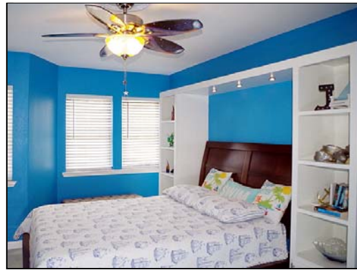
Guest Bedroom #1 Guest Bedroom #1 features shelving with reading lights.