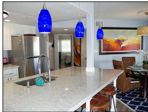
Kitchen Totally remodeled kitchen!