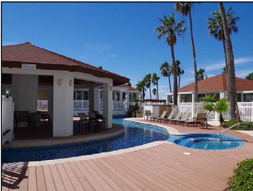
Pool Pool and hot tub.