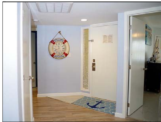
Foyer Welcome home!