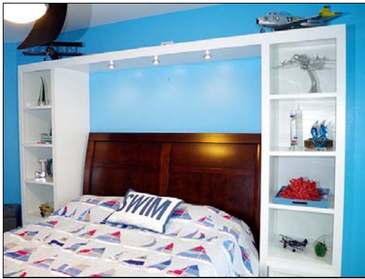
Guest Bedroom #2 Guest Bedroom #2 has shelving with reading lights.