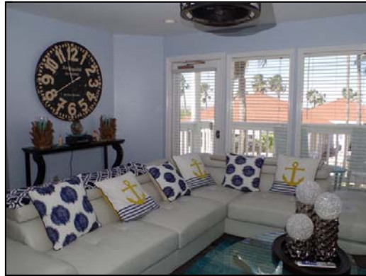
Living All new furniture and decor! Selling completely furnished!