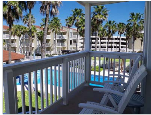
Balcony The balcony overlooks the pool, and provides a partial bay and bridge view.