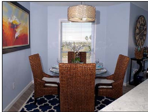
Dining Cute, tropical new dining room furniture!