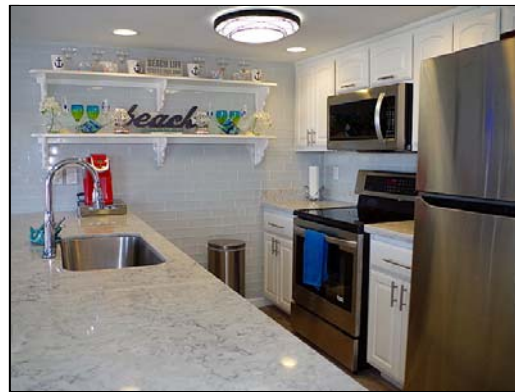
Kitchen Quartz counters and stainless steel appliances.