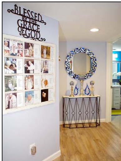
Foyer Welcome home!