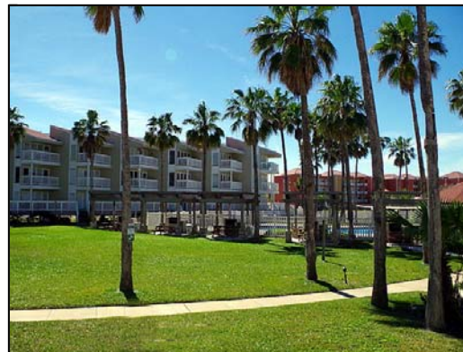
Lawn Gulfpont provides plenty of green space.