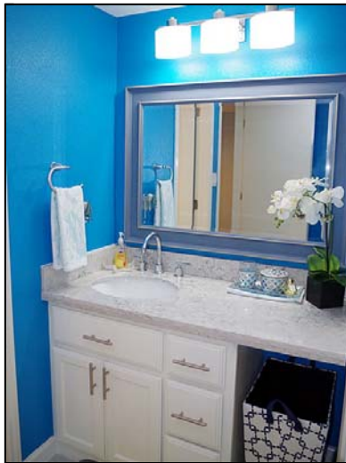
Guest Bath #1 Guest bath #1 has quartz countertop.