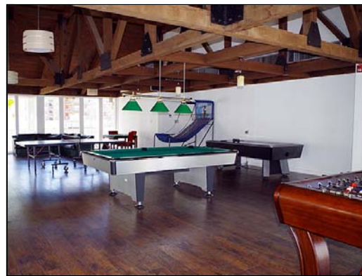
Gulfpont Gameroom Plenty of fun for kids of all ages in the Gulfpont gameroom!