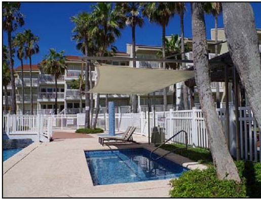
Kiddie Pool Shaded kiddie pool.