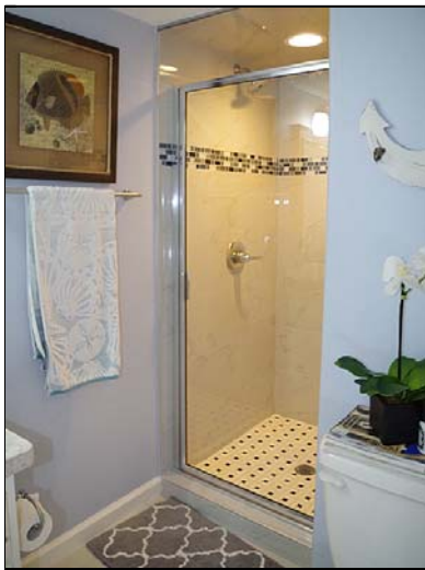
Guest Bath #2 Guest bath #2 has a custom tiled shower