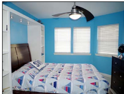
Guest Bedroom #2 Guest Bedroom #2 has access to the hall bath.