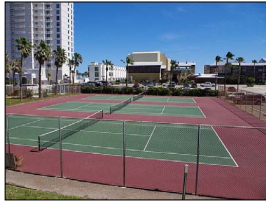
Tennis Tennis courts for Gulfpoint owners and guests only.