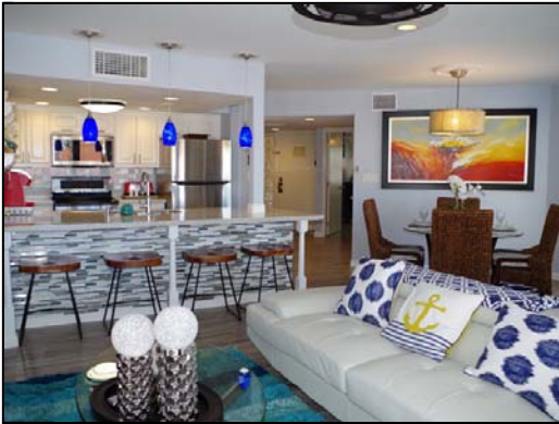
Living All new furniture and decor! Selling completely furnished!