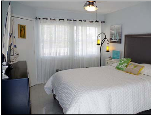
Master Bedroom Master bedroom has all new furniture.