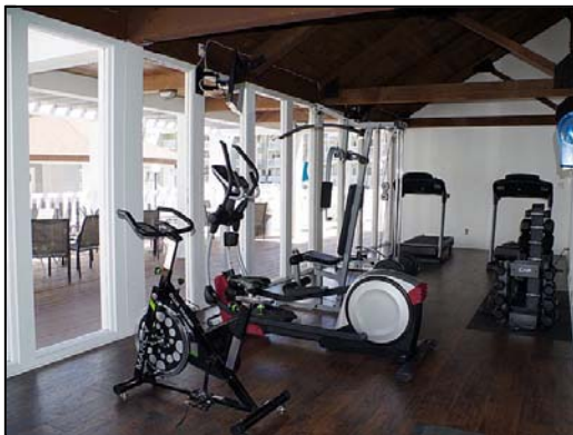
Gulfpont Gym Gulfpont gym