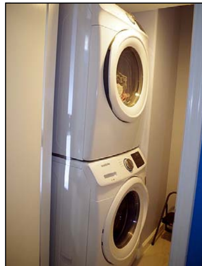
Laundry Remodel of this condo included the addition of an in-unit laundry room.