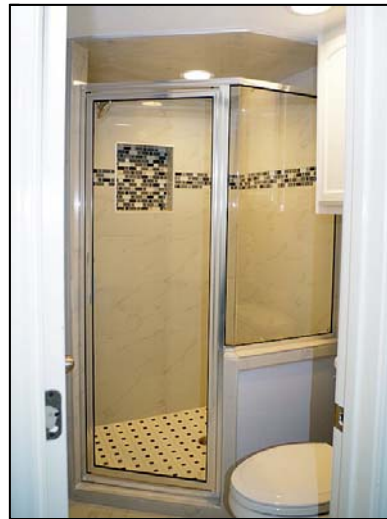
Guest Bath #1 Guest bath #1 has a custom tiled shower.