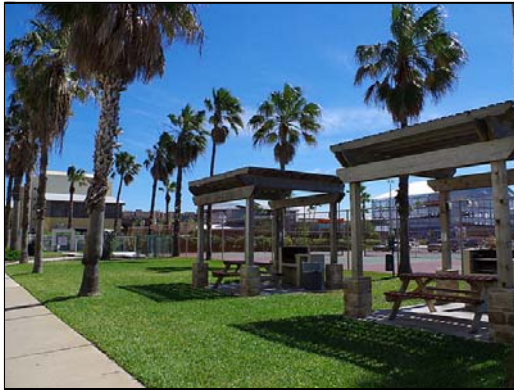
BBQ area Gulfpoint has multiple BBQ areas.