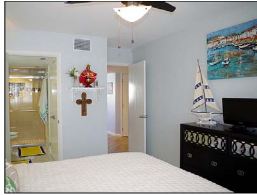
Master Bedroom Master bedroom has ensuite bath.