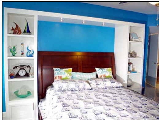
Guest Bedroom #1 Guest Bedroom #1 features shelving with reading lights.