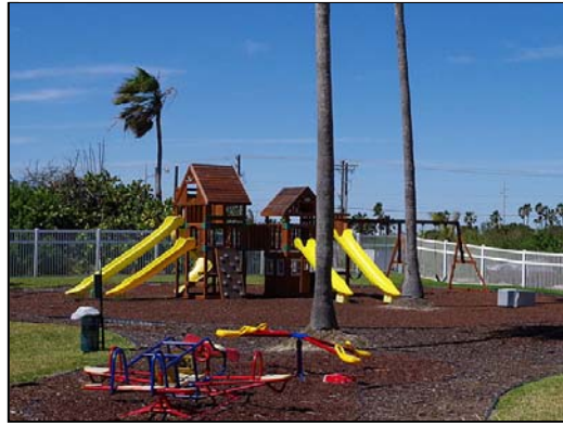
Gulfpoint Playground Plenty of room for the kids to play at Gulfpoint.