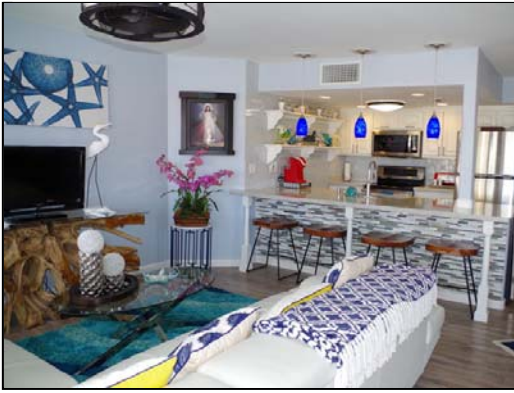
Living Plenty of room for family and friends in the spacious living area.