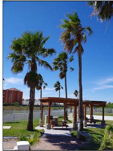
BBQ area Gulfpoint has multiple BBQ areas.