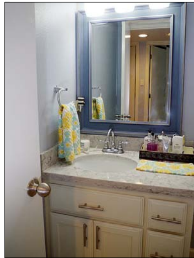
Guest Bath #2 Guest bath #2 has quartz countertop.