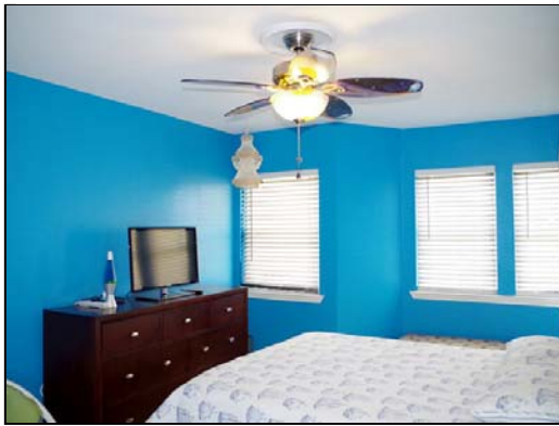
Guest Bedroom #1 Guest bedroom #1 has an ensuite bath and closet.