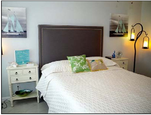
Master Bedroom Selling fully furnished!