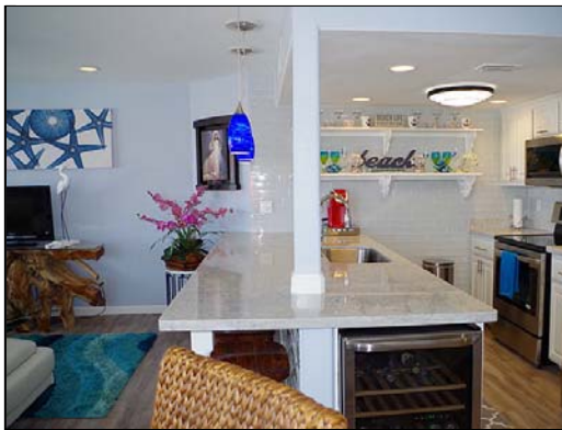
Kitchen Totally remodeled kitchen!