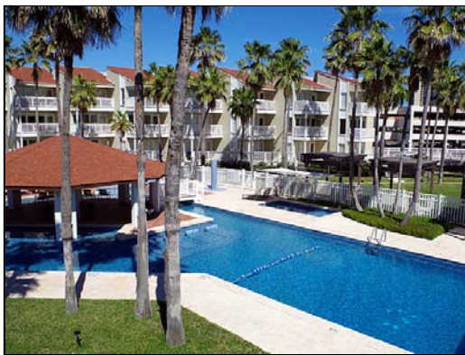
View From Balcony The balcony overlooks the pool, and provides a partial bay and bridge view.