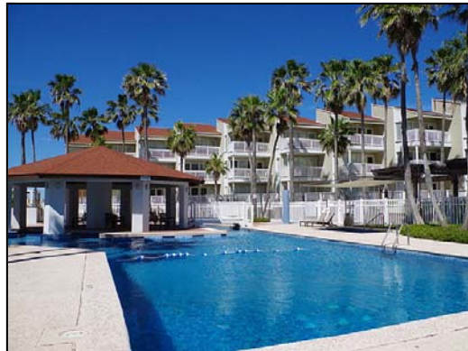
Pool Gulfpoint pool has gazebo in the center.