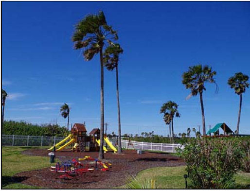
Gulfpoint Playground Plenty of room for the kids to play at Gulfpoint.