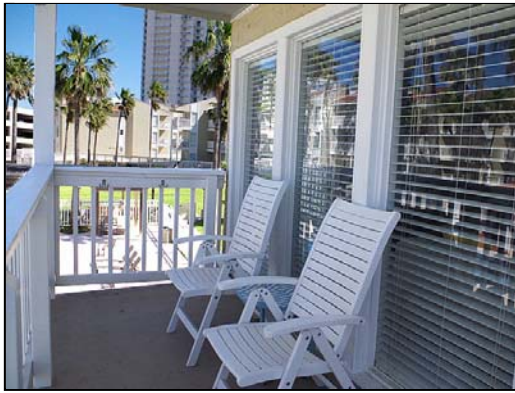
Balcony The balcony overlooks the pool, and provides a partial bay and bridge view.