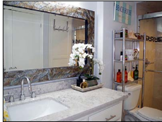
Master Bath Master bath has quartz countertop.