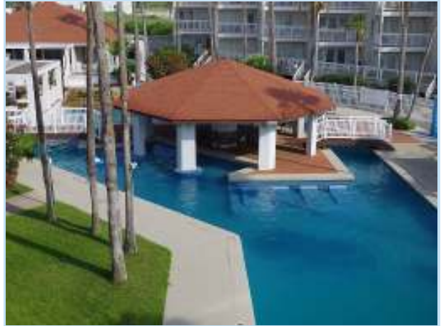
view of Gulfpoint pool from balcony