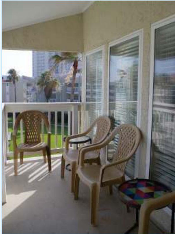
windows replaced recently