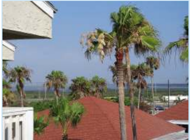
partial view of bay and causeway from balcony