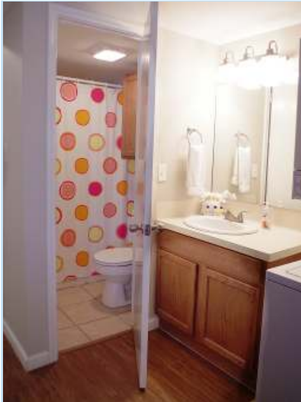
full bath with tub/shower combo