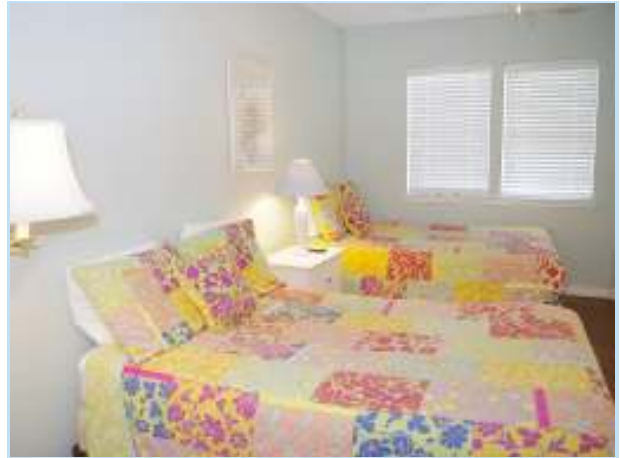
room in guest bedroom for 2 full beds