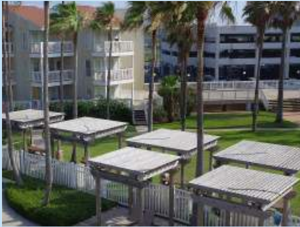
view of Gulfpoint picnic area from balcony