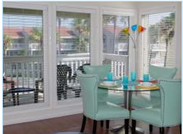
lots of natural light