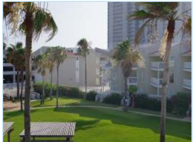
view of Gulfpoint lawn from balcony