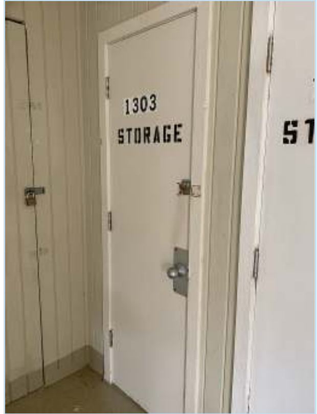
exterior storage unit