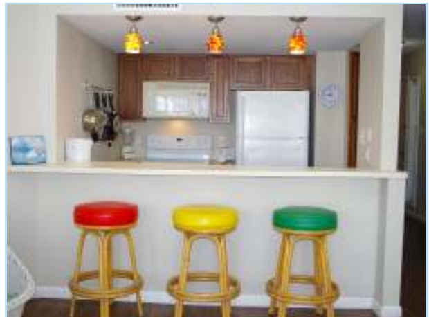
additional seating at kitchen bar