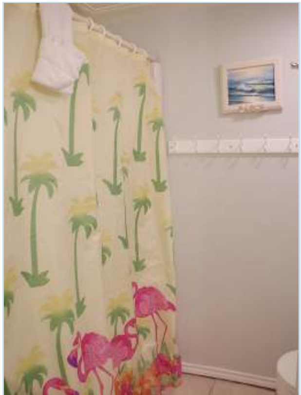
full bath with tub/shower combo