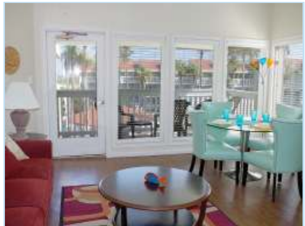
selling fully furnished