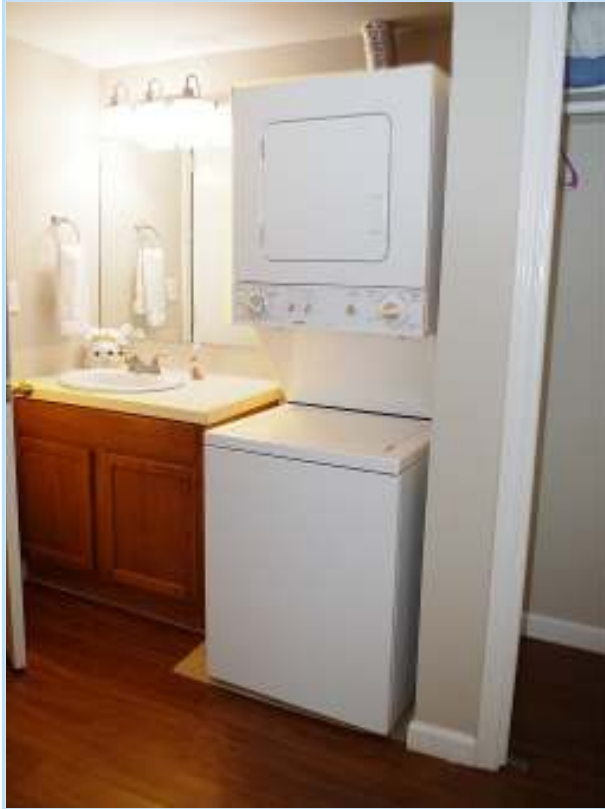
convenient in-unit washer dryer - not all units have a washer/dryer