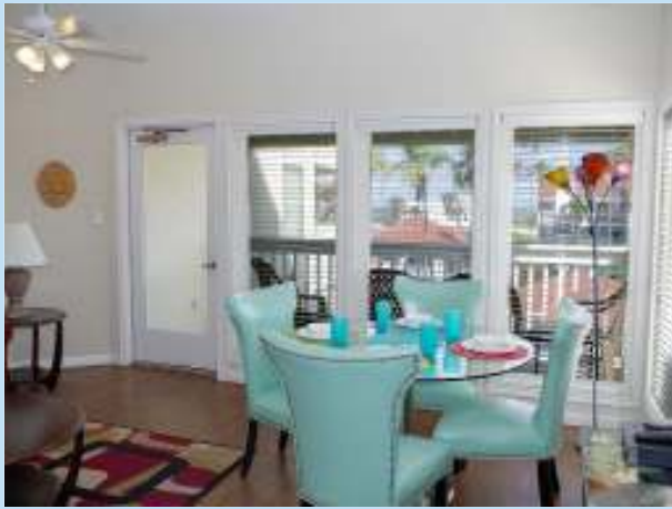
wall of windows