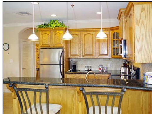
kitchen pendant lighting