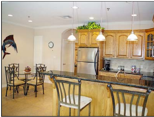
kitchen/dining seating for 6