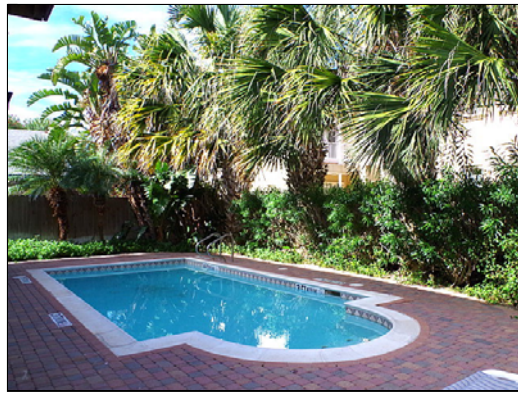
pool shady palm trees