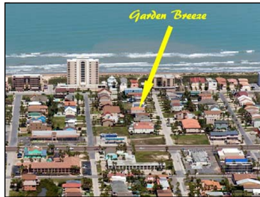
aerial view 1/2 block to the beach