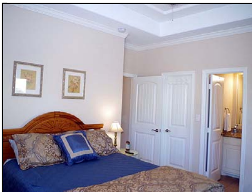
master bedroom large walk-in closet in master