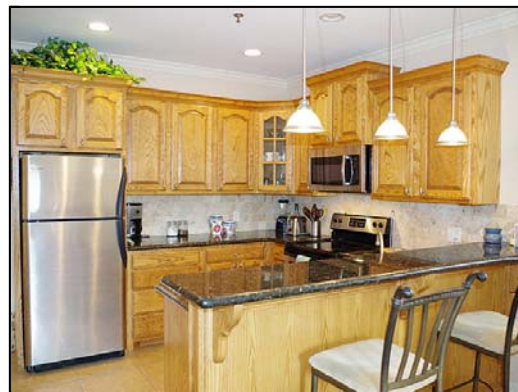
kitchen plenty of cabinet space