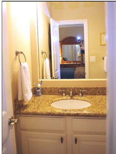
master bath granite vanity in master bath