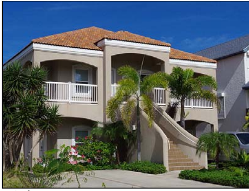
exterior stucco exterior with tile roof