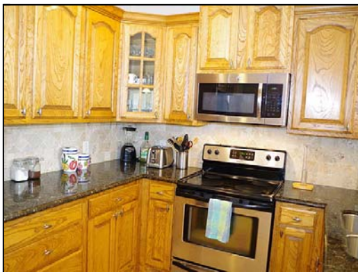
kitchen tile backsplash