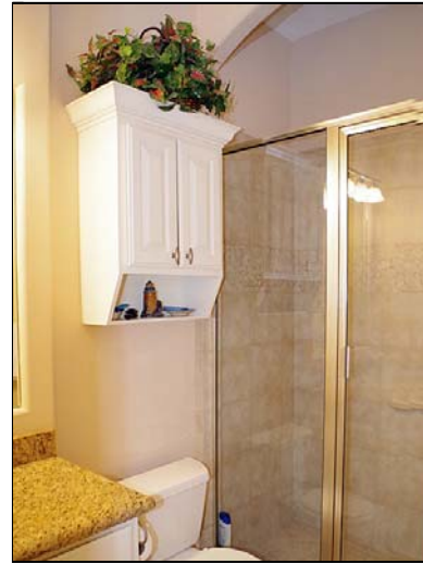
master bath custom tiled shower in master bath