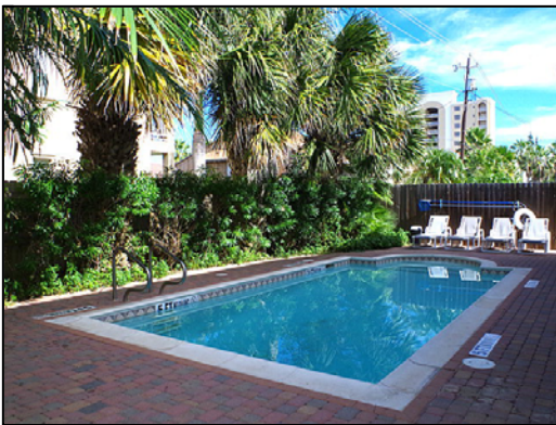
pool brick pavers