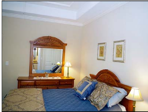
master bedroom spacious master bedroom