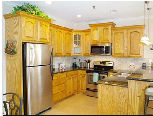
kitchen stainless steel appliances