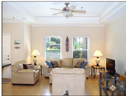
living open concept