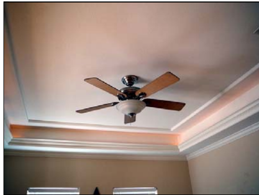
tray ceiling tray ceilings with uplighting