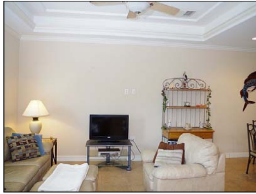
living spacious living area