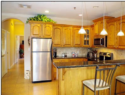
kitchen granite counters