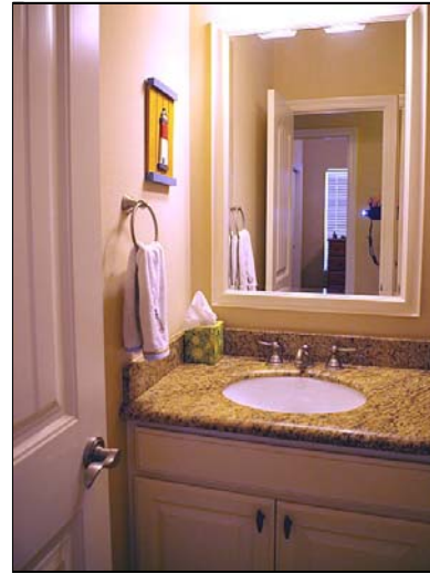
guest bath guest bath has granite vanity