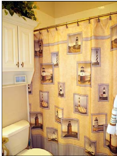
guest bath guest bath has tub/shower combo