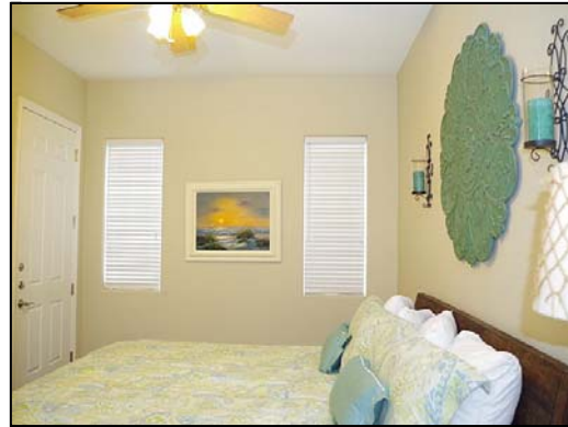
master bedroom master has exterior door leading to pool