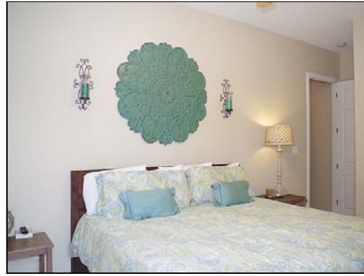
master bedroom spacious master bedroom has king bed