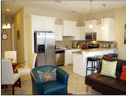
living/kitchen living areas flows into kitchen