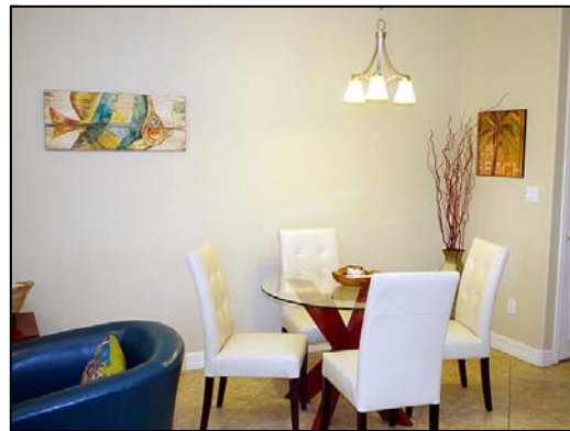
dining light and bright dining area