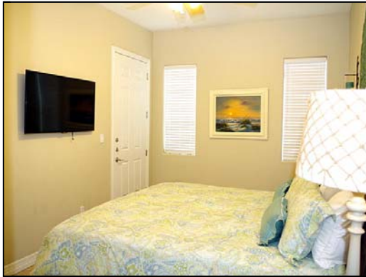
master bedroom TV in every bedroom