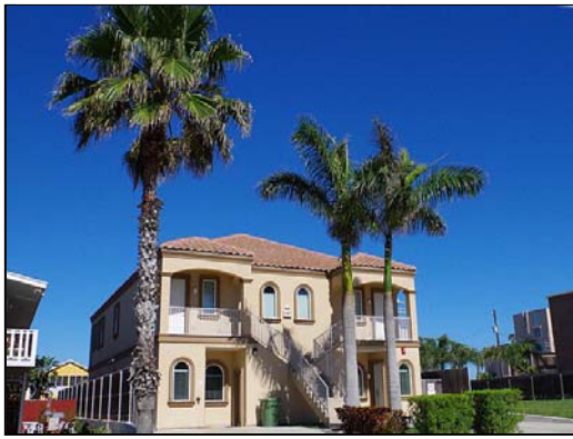
exterior view stucco exterior