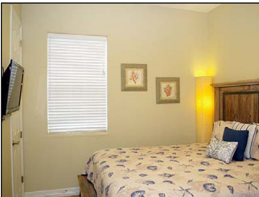
guest bedroom 1 TV in every bedroom