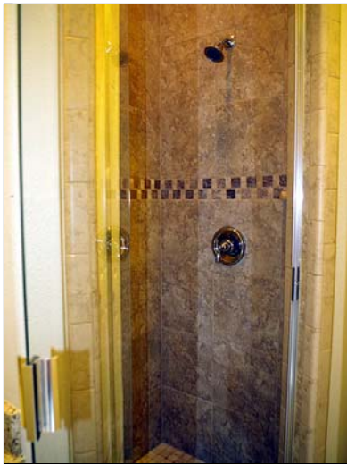
guest bath 2 custom tiled shower in guest bath #2