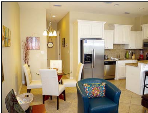
living/dining open concept living and dining