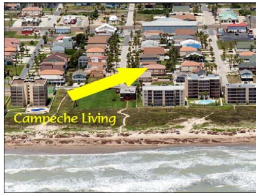
aerial view just steps from the beach