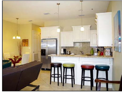
living/kitchen additional seating at kitchen counter