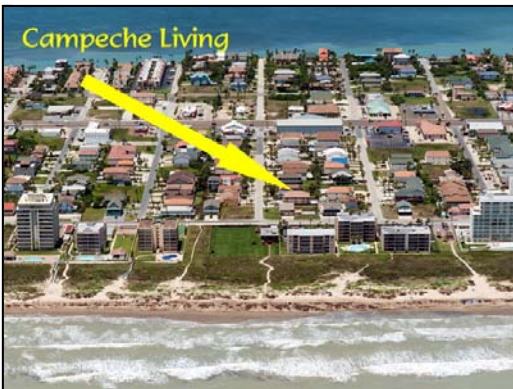
aerial view 3rd lot from Gulf Blvd.