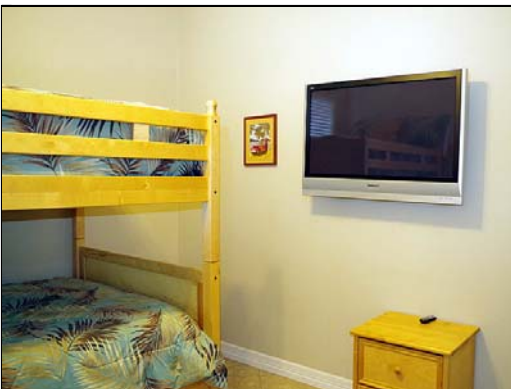
guest bedroom 2 TV in every bedroom