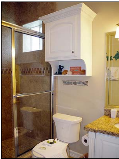
master bath ensuite master bath