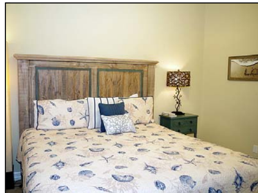
guest bedroom 1 spacious guest bedroom #1 as king bed