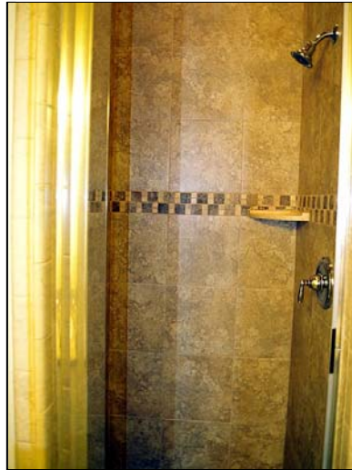
guest bath 1 custom tiled shower in guest bath #1