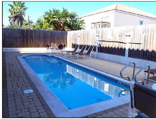
pool pool shared by only 4 condos