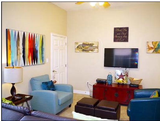
living selling fully furnished