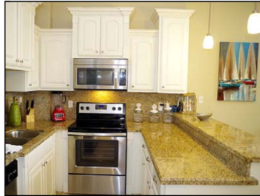
kitchen granite counters