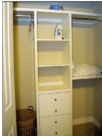
guest bedroom 2 guest bedroom #2 has closet has built-in dresser and shelves