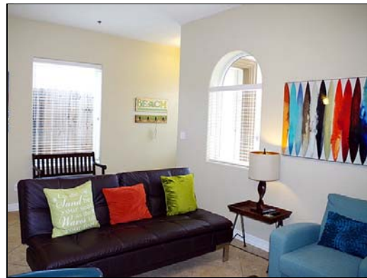
living couch can fold down into a bed