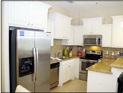
kitchen custom cabinets