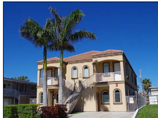
exterior view tile roof