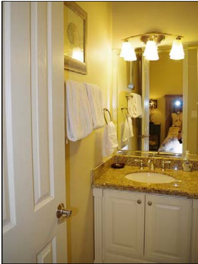
guest bath 1 guest bath #1 has granite countertop