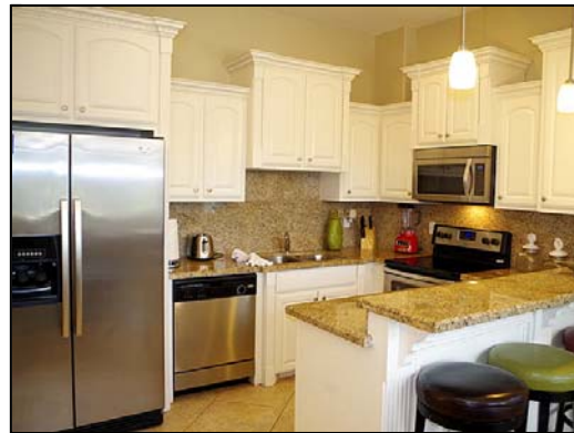
kitchen stainless steel appliances