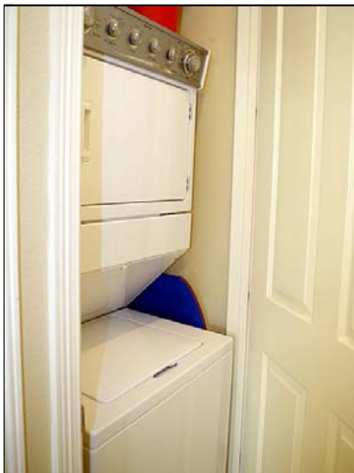
utility convenient in-unit washer/dryer