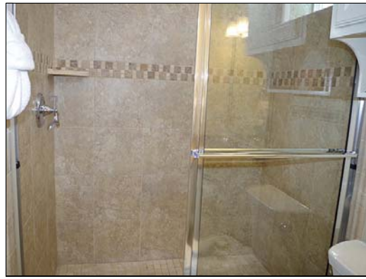
master bath huge custom tiled shower in master bath