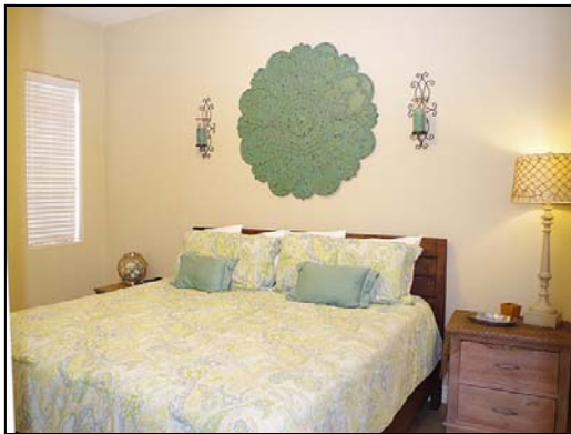
master bedroom relaxing colors in the master suite