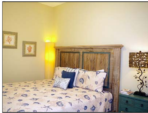
guest bedroom 1 guest bedroom #1 could be thought of as a 2nd master suite