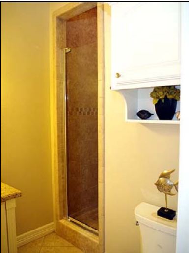
guest bath 1 ensuite bath