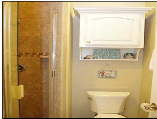
guest bath 2 guest bath #2 is accessible from the hall