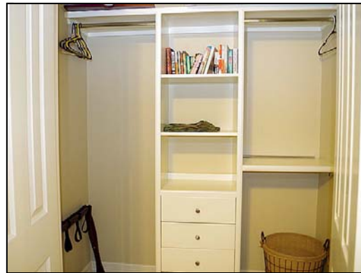
master bedroom master closet has built-in dresser and shelves