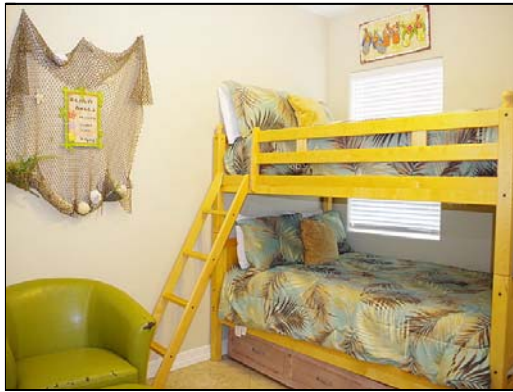
guest bedroom 2 guest bedroom #2 has fun bunk beds