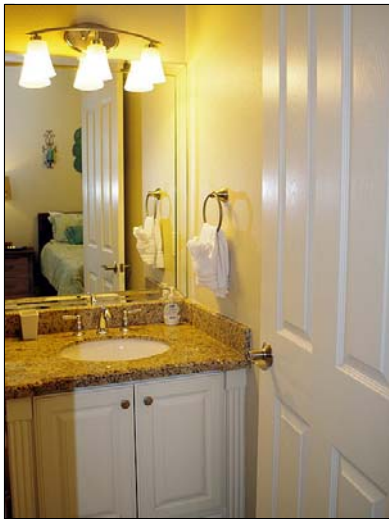
master bath master bath has granite countertop