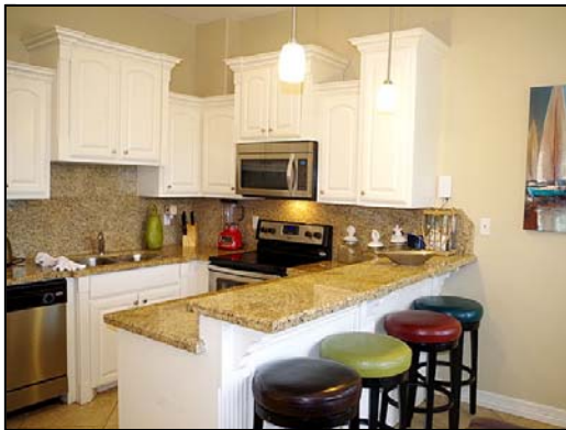
kitchen granite backsplash