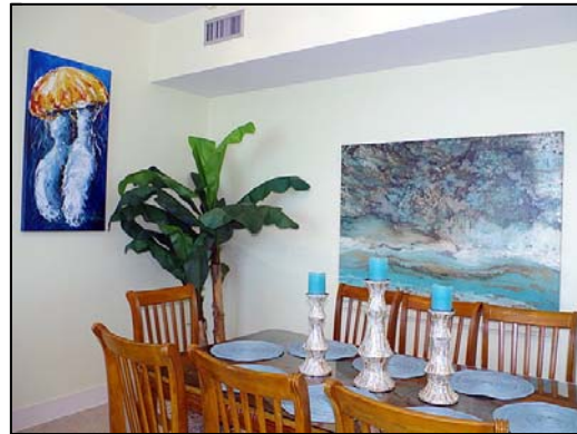
dining dining space for 6 guests