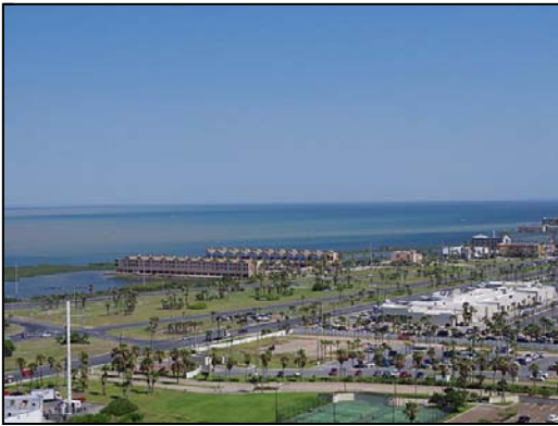
west view view from west balcony