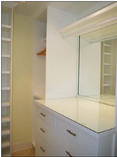
master closet custom shelving in master closet