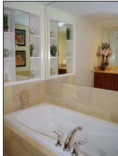
master bath master bath has jetted tub and separate shower