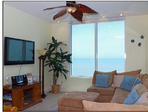
living emerald bay floorplan has large living area