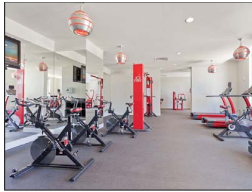
gym Sapphire gym