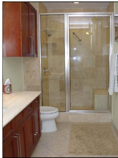
guest bath guest bath with custom tiled shower