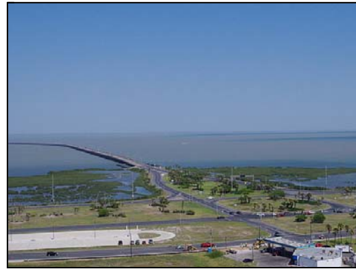
west view view from west balcony