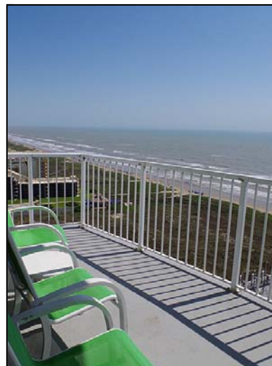
east balcony spacious north corner east balcony