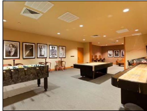
gameroom Sapphire gameroom