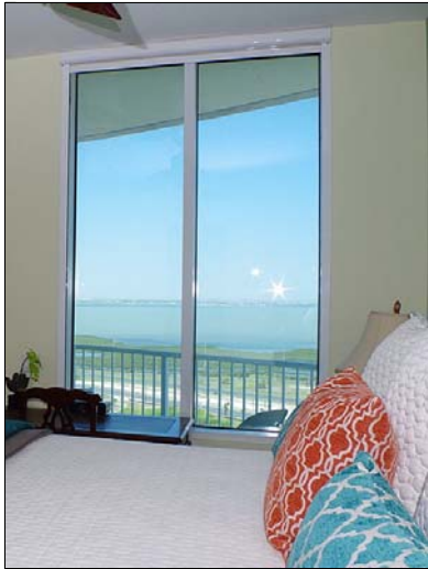
master bedroom wake up to this view!