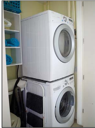
utility convenient in-unit washer/dryer