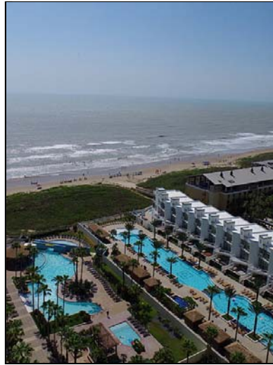
east view view of pool from balcony