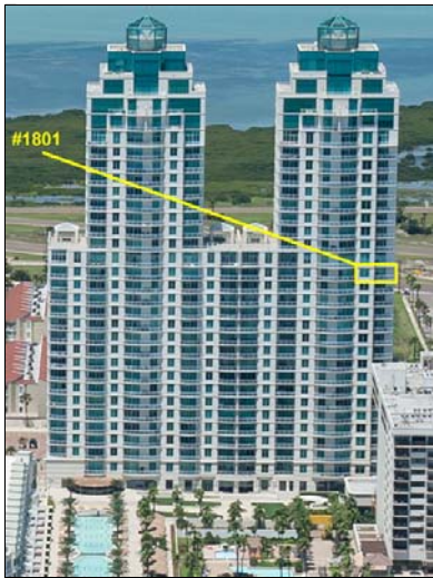
#1801 is on the north corner