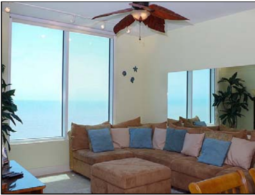
living gorgeous ocean view from living area