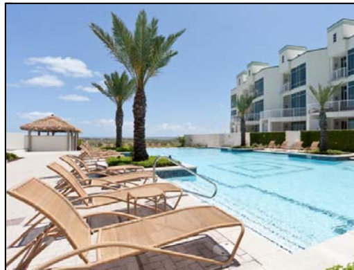
pool Sapphire has the largest pool on SPI