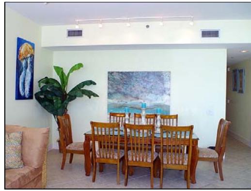
dining very spacious dining area