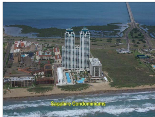
aerial aerial view of SPI's tallest condominium