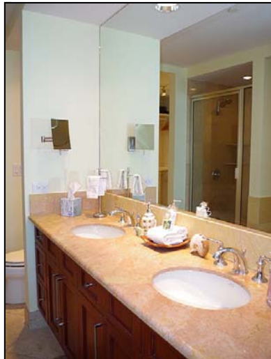
master bath double sing in master bath