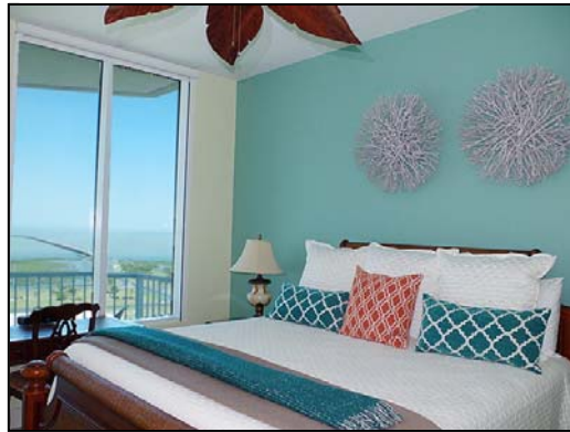
master bedroom view of the bridge from master bedroom