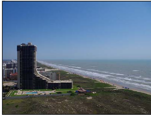
east view stunning panoramic views from balcony