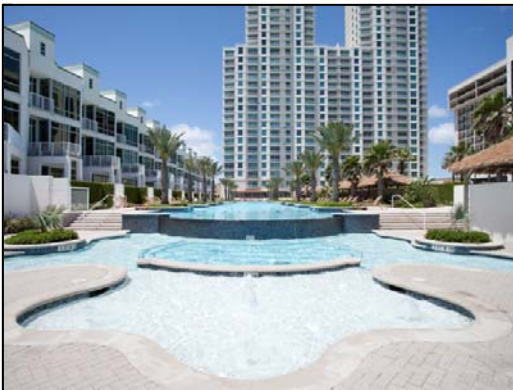
pool Sapphire has the largest pool on SPI