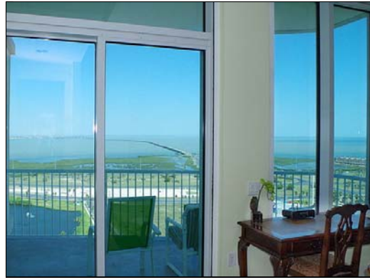
master bedroom master bedroom has west balcony access