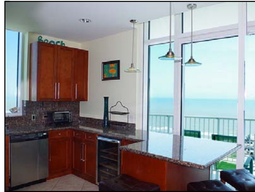
kitchen ocean view from the kitchen