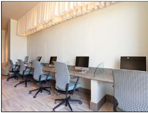
business ctr Sapphire business center