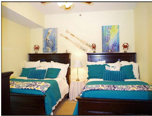
guest bedroom 1 guest bedroom 1 has cute beachy decor