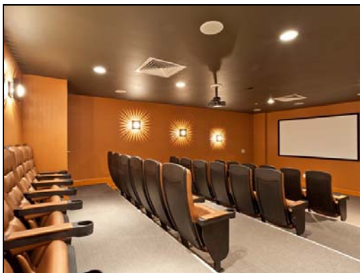
theatre Sapphire theatre