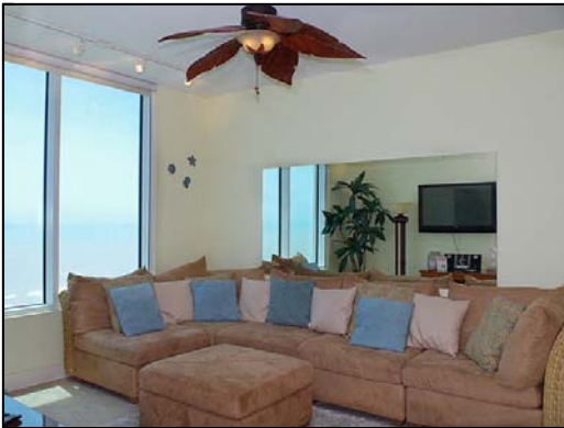
living plenty of room for relaxing