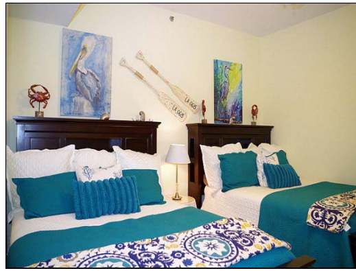
guest bedroom 1 guest bedroom 1 has ensuite bath