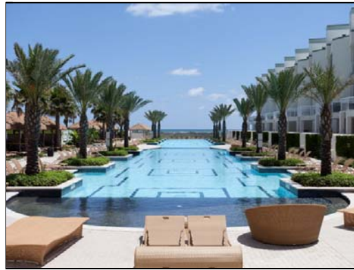
pool Sapphire has the largest pool on SPI