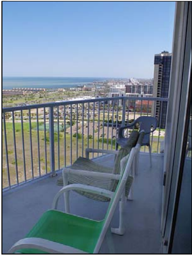
west balcony spacious north corner west balcony