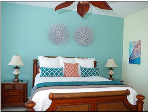
master bedroom tastefully decorated master bedroom