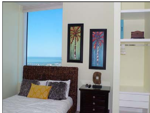
guest bedroom 1 guest bedroom 2 has awesome north view