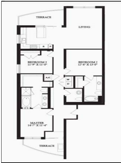
floorplan emerald bay floorplan has 3 bedrooms, 2.5 baths, connects east to west