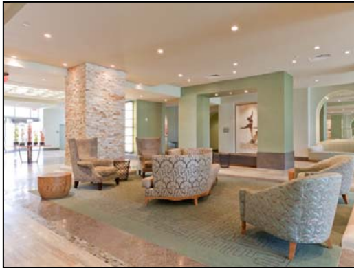
lobby Sapphire lobby