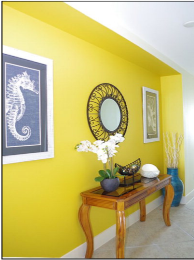
entry welcoming entry hall