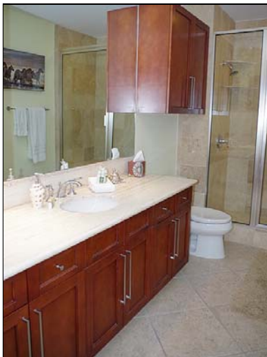
guest bath guest bath has spacious countertop