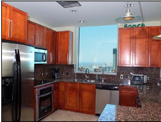
kitchen granite counters, stainless steel appliances