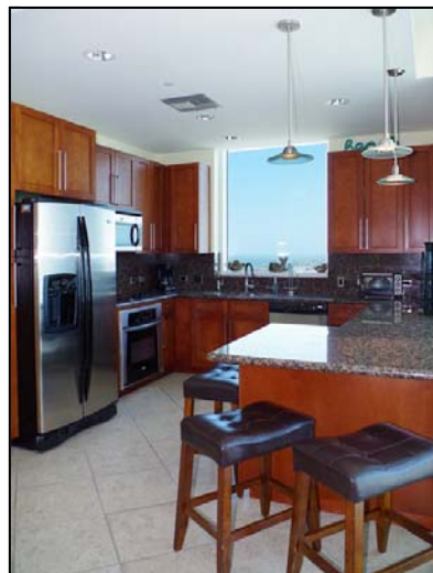
kitchen extra seating for more guests