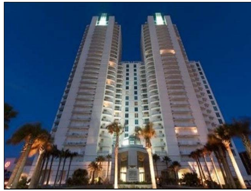
tower night view