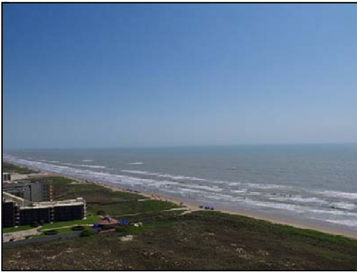
east view stunning panoramic views from balcony