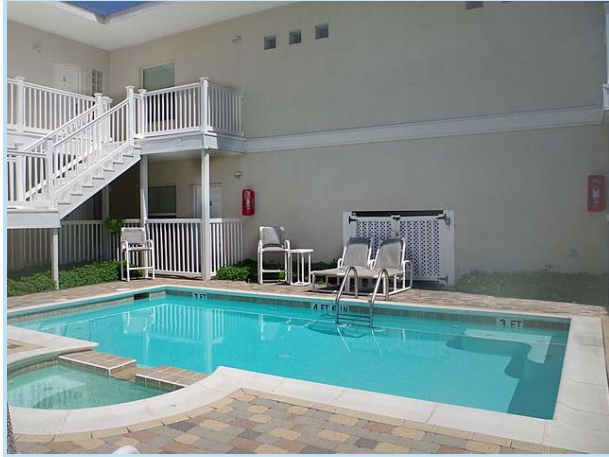
only 10 units share the pool