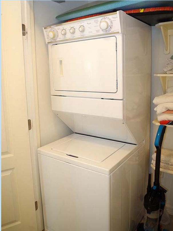
convenient in-unit washer/dryer and lots of storage