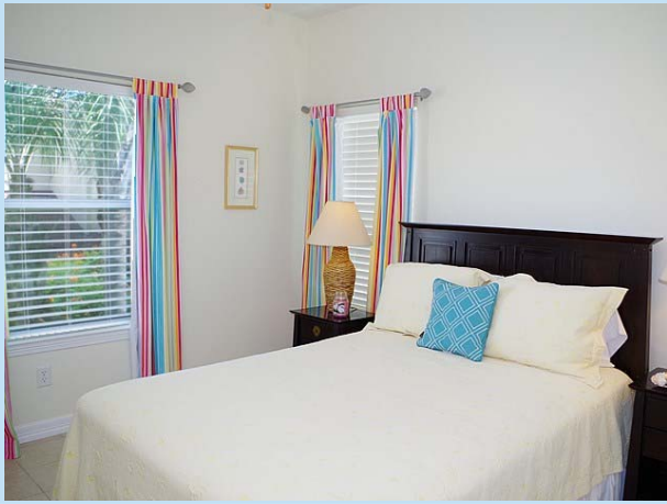
confy master bedroom