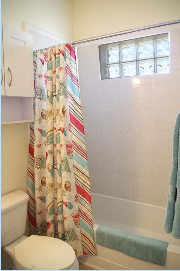
tiled tub/shower combo