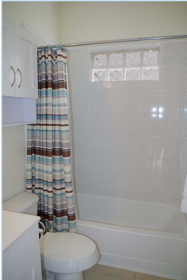
tiled tub/shower combo