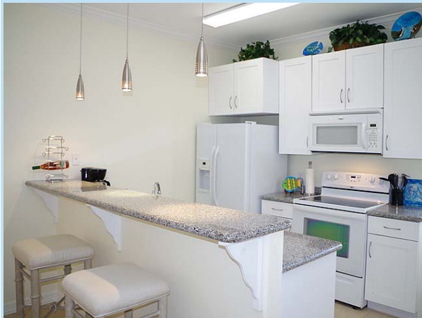
all appliances convey with sale