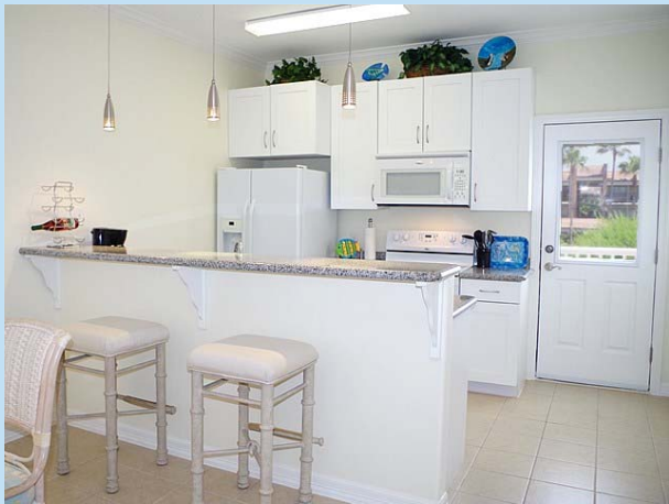
lots of cabinet space