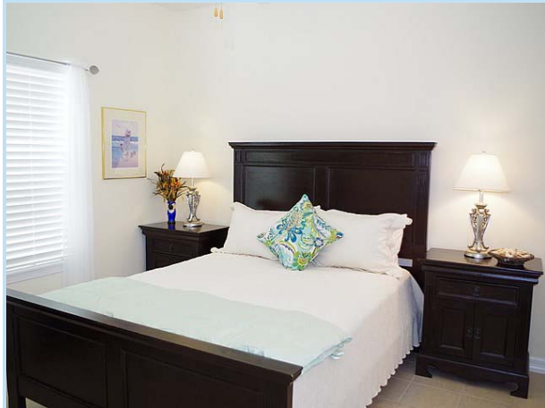
comfy guest bedroom