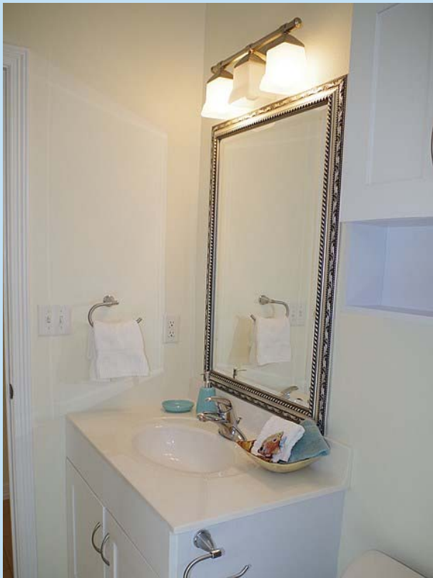
guest bath in hallway, convenient to living area and guest bedroom