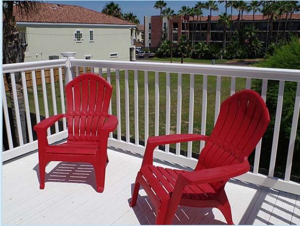
your own private balcony