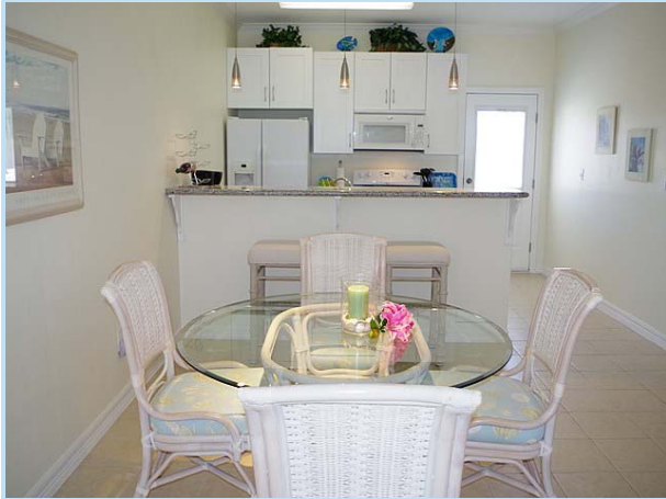
open concept dining & kitchen