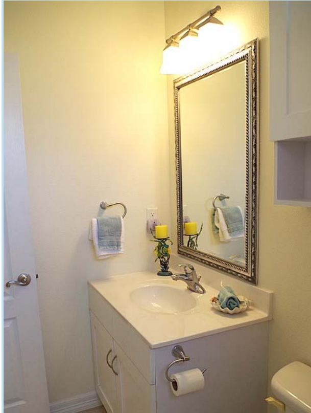
master has ensuite bath