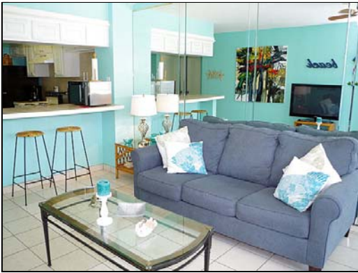
living beachy décor