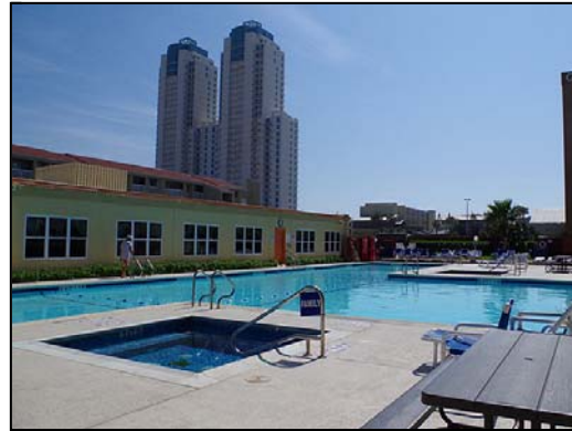
pool & hot tub

Gulfview I has 2 hot tubs, one for adults, and one for families.