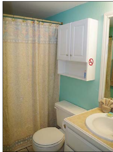
bath bath has tub/shower combo