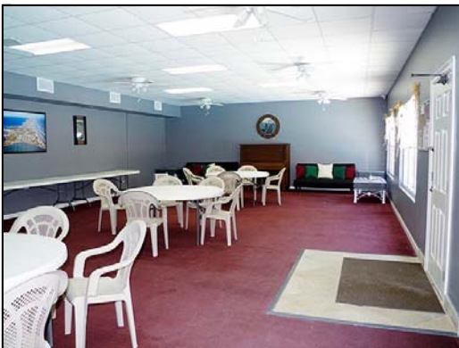
Gulfview I clubhouse

a place for residents and their family and friends to gather