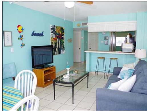
living open concept living area