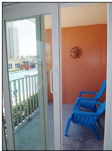
private balcony poolside balcony