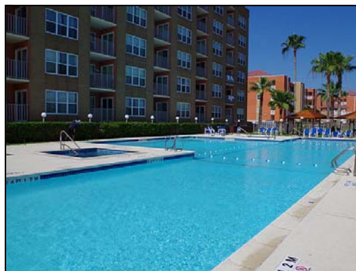
pool Huge pool!