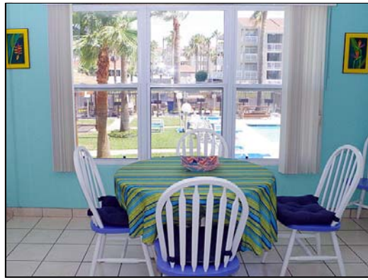
dining light, bright dining area