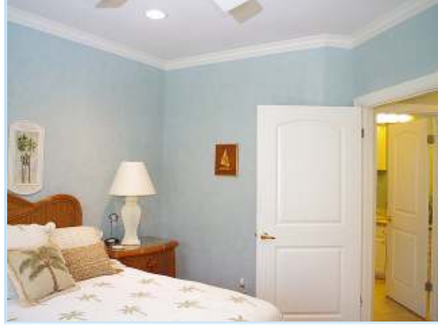
easy access to 2nd floor guest bath