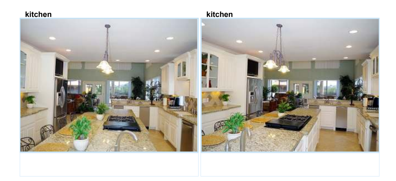
Jenn-Air gas stove and prep sink on island