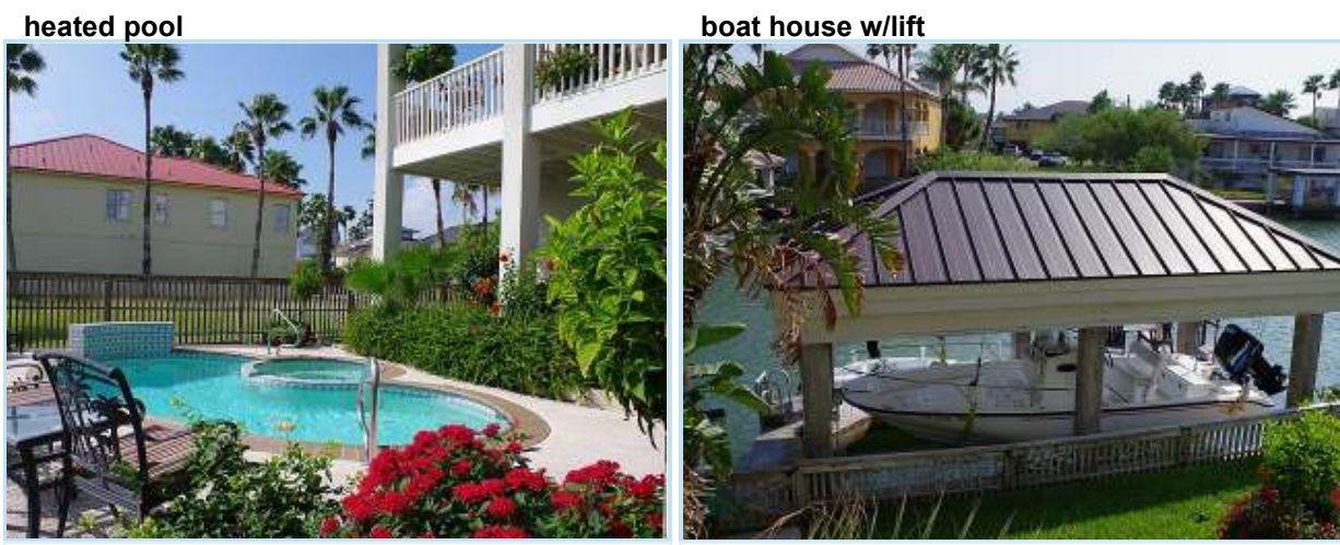
heated pool with hot tub and waterfall feature