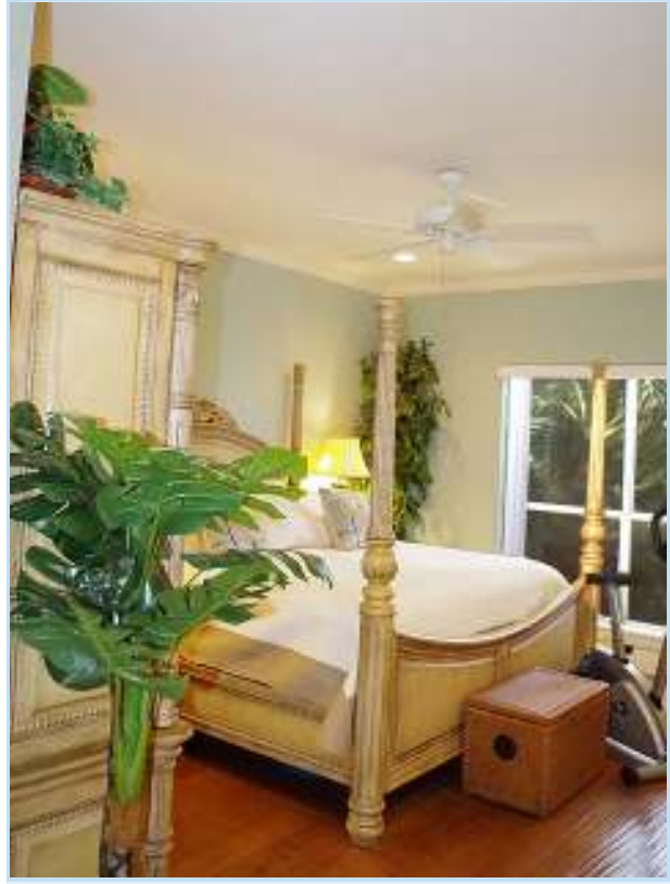
master bedroom has hardwood flooring