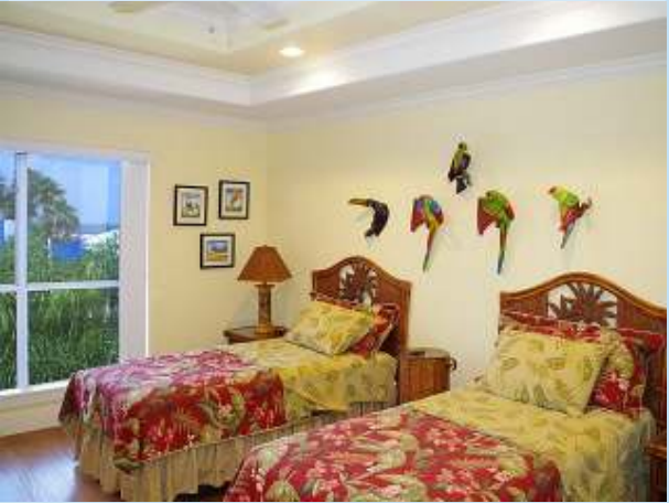
3rd floor guest bedroom 2 has partial bay view