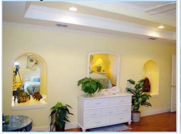
3rd floor guest bedroom 1 has lighted decorative niches