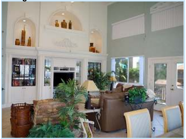
built-in shelving with lighted niches