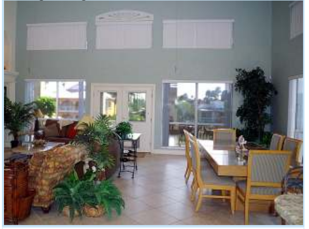
20ft ceiling in living/dining