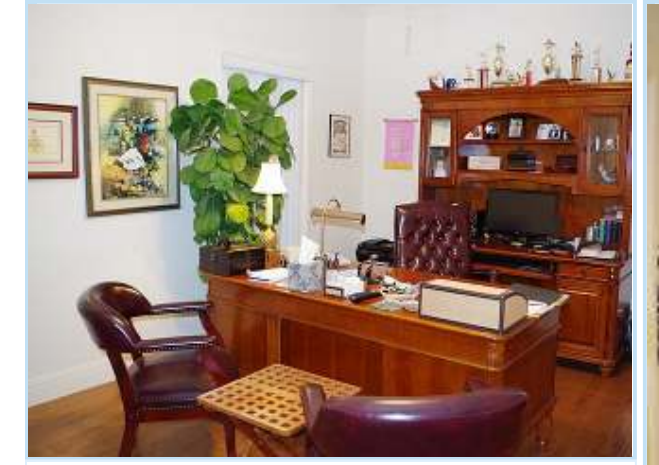
1st floor bedroom or office