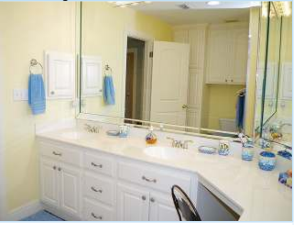
both 3rd floor bedrooms have access to guest bath