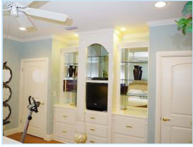
master has two closets, built-in shelving, and lighted decorative niches