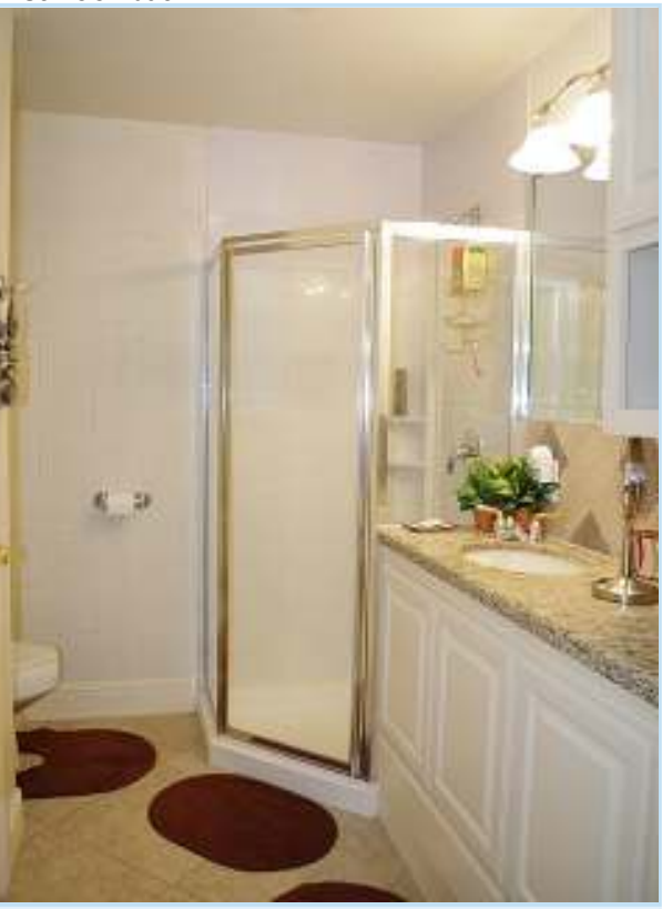
1st floor has full bath with tiled shower