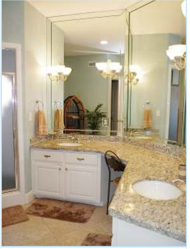
master bath has double sinks with vanity seating and tiled shower