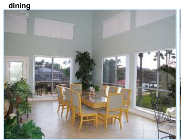
impact resistant solar screens on all windows