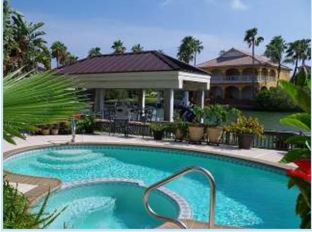
heated pool with hot tub