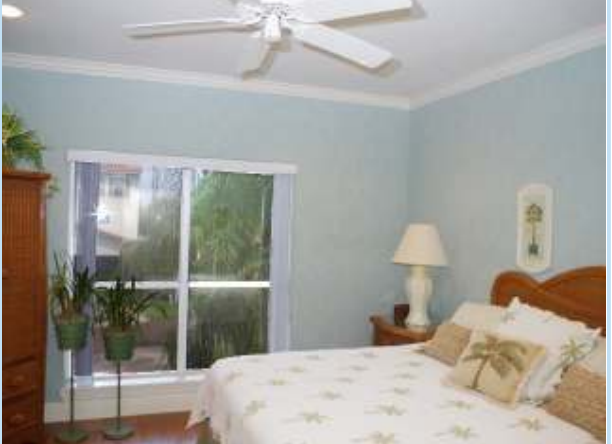
guest bedroom on 2nd floor has hardwood flooring