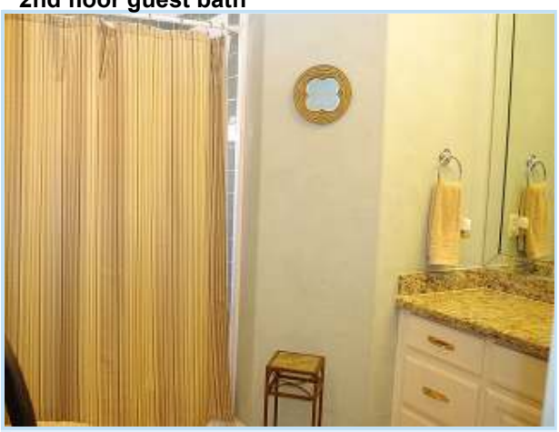
full tub/shower combo in 2nd floor guest bath