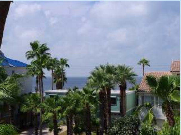
partial bay view from 3rd floor balcony