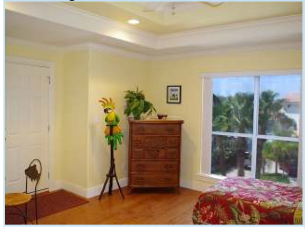
3rd floor guest bedroom 2 has hardwood flooring and access to balcony