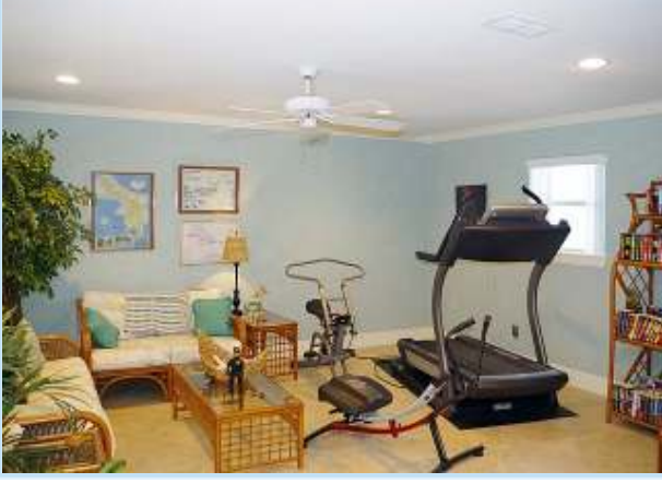
spacious 3rd floor loft