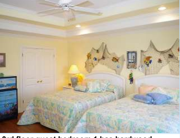
3rd floor guest bedroom 1 has hardwood flooring