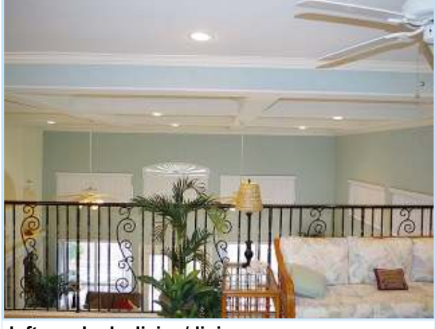
loft overlooks living/dining area