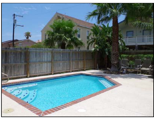
pool private pool