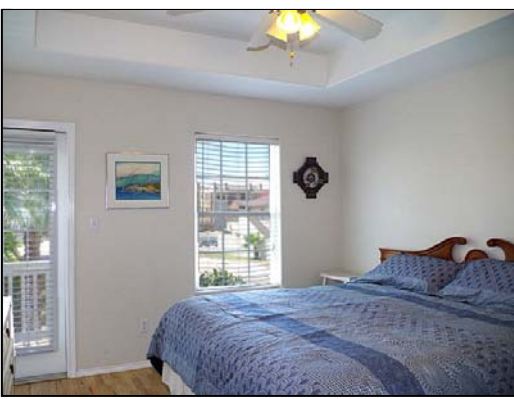
master bedroom spacious master suite