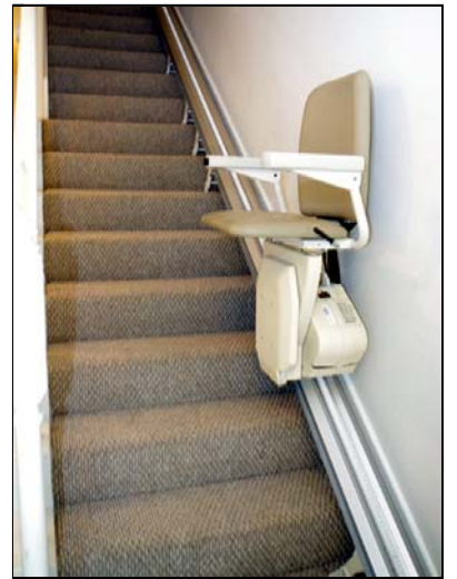
chair lift electric chair lift on stairs