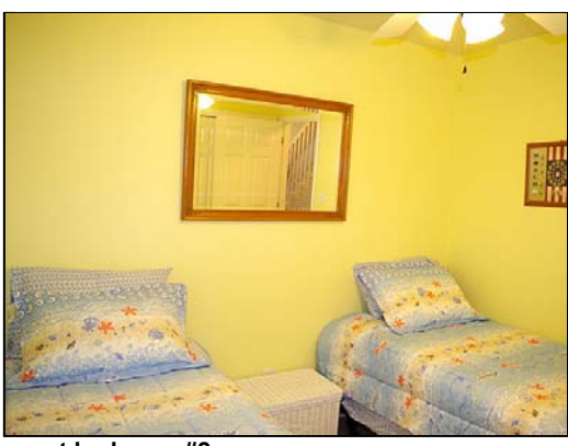
guest bedroom #2