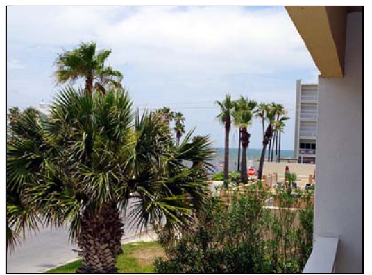
front balcony partial ocean view