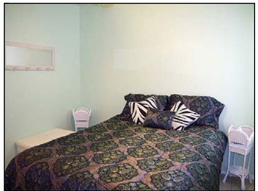
guest bedroom #1 guest bedroom on 1st floor