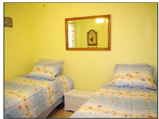
guest bedroom #2 guest bedroom on 1st floor