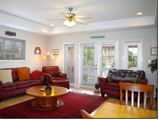
living access to front balcony from living area