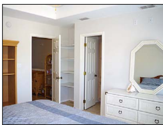
master bedroom built in shelves