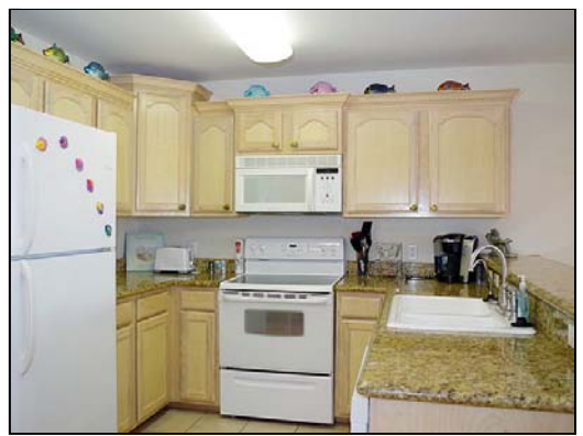
kitchen plenty of cabinet space