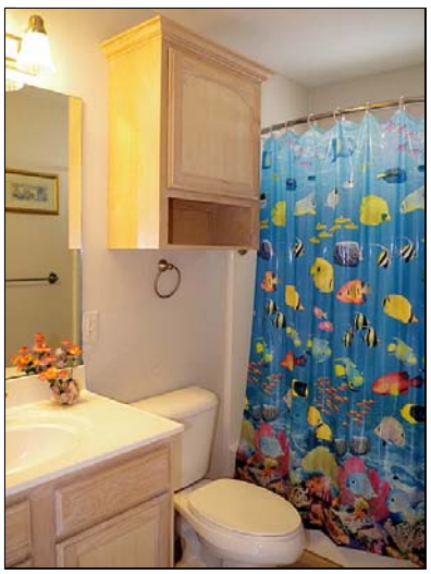
master bath ensuite full bath with tub/shower combo