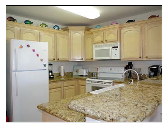
kitchen all appliances convey with sale