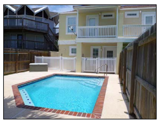
pool pool on south side of home