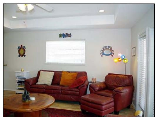
living selling furnished