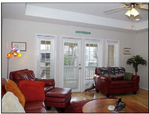
living light and bright