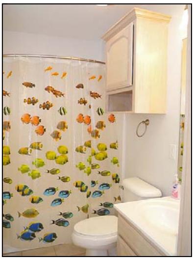
guest bath guest bedrooms share 1st floor full bath with tub/shower combo