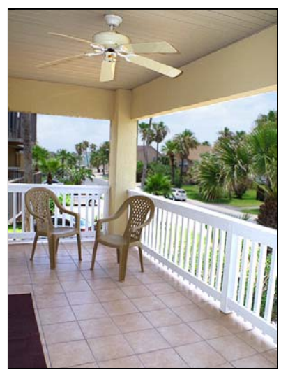
front balcony front balcony