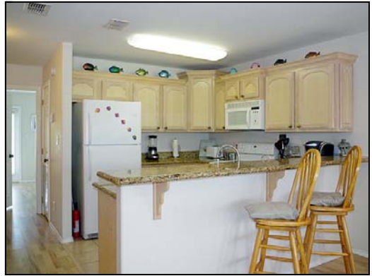
kitchen additional seating