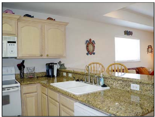
kitchen granite counters