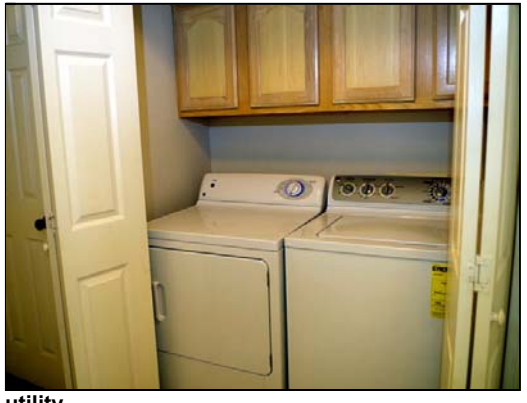
utility full size washer/dryer on 1st floor