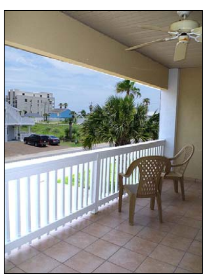
front balcony partial ocean view