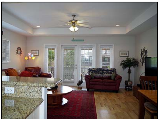
living open concept