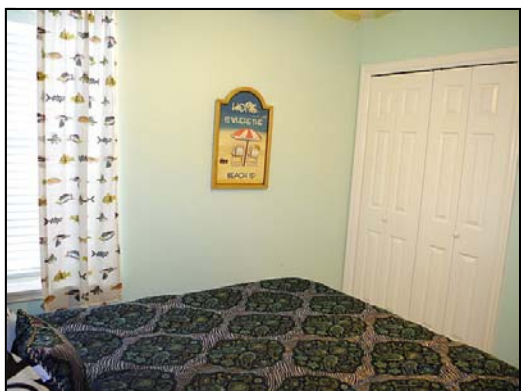
guest bedroom #1 large closet