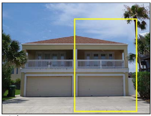
exterior unit b - west side of building