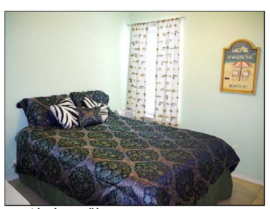
guest bedroom #1 queen bed guest bedroom