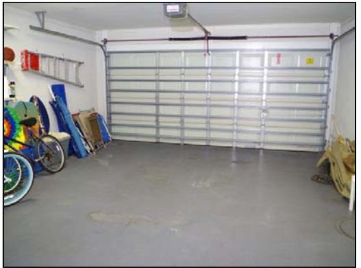
garage 2-car garage