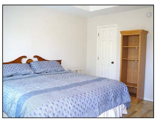
master bedroom walk in closet