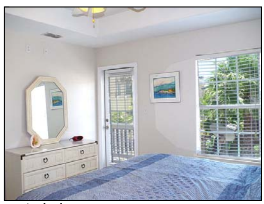
master bedroom master has access to balcony overlooking pool