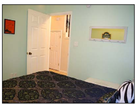
guest bedroom #1