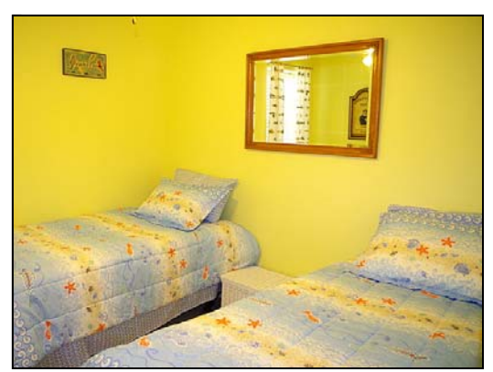
guest bedroom #2 twin beds