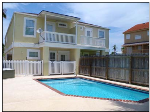
pool covered balcony overlooks pool