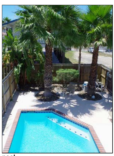
pool shady poolside palms