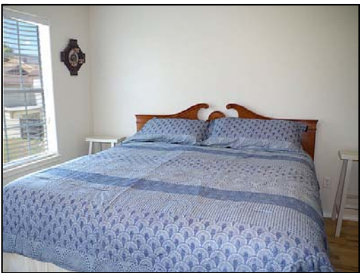
master bedroom king bed