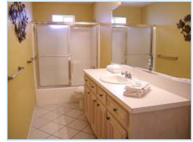
plenty of counter space in guest bath