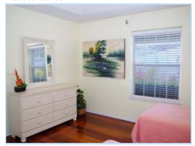
overlooks pool area