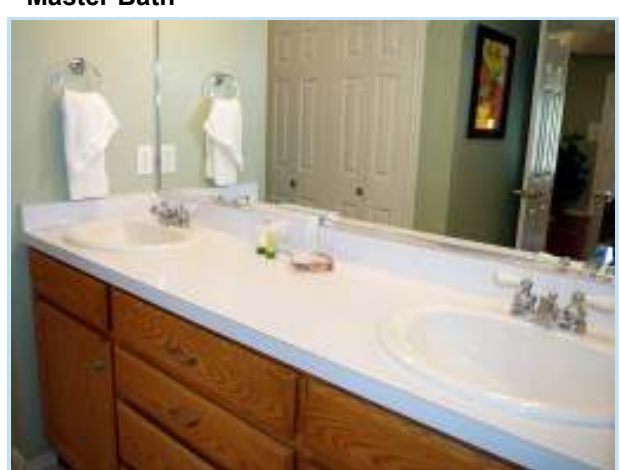
double sink in master bath