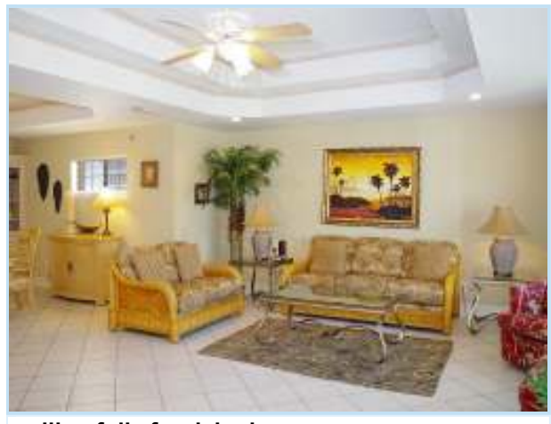
selling fully furnished