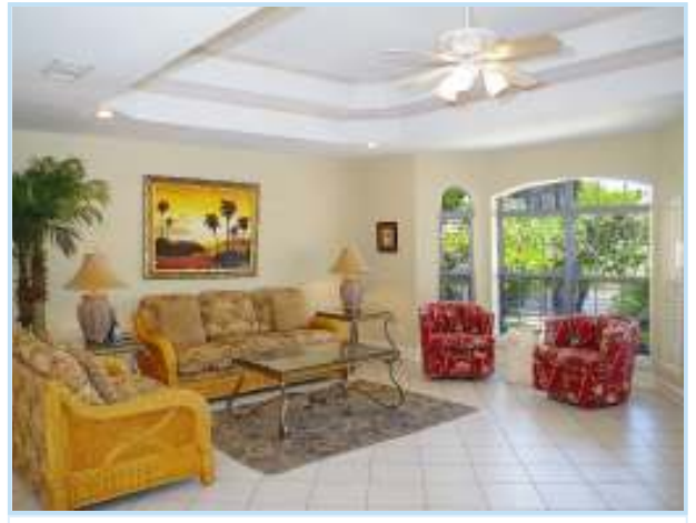
open concept living