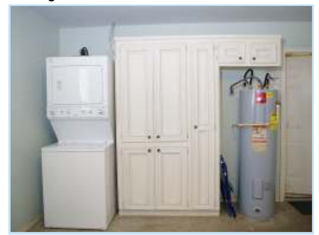
washer/dryer in garage