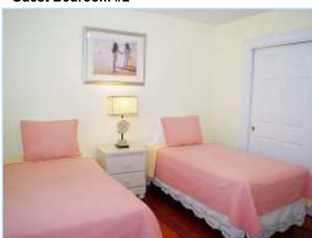
ample closet space