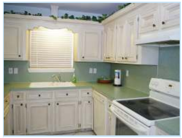
lots of cabinet space