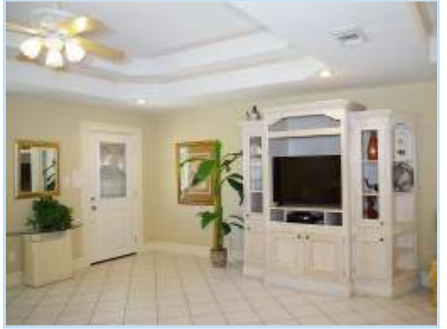
custom ceiling in living