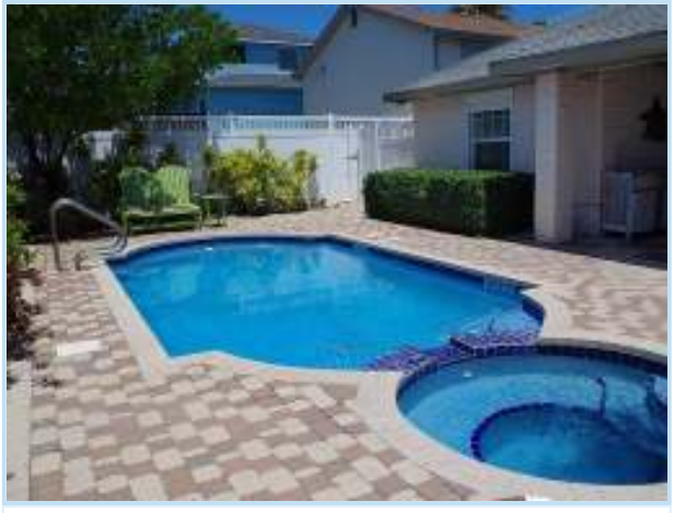
heated pool and hot tub