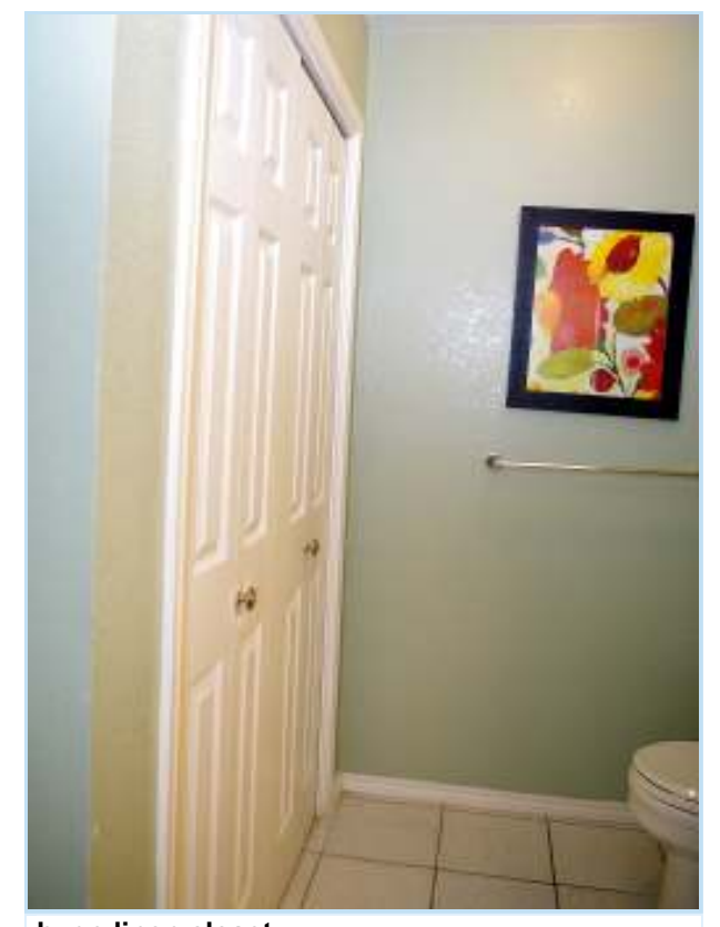
huge linen closet