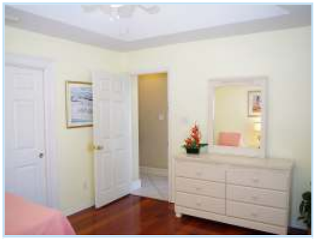
gorgeous hardwood floors