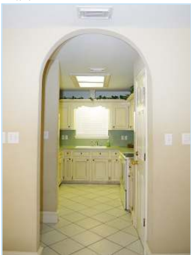
archway leads to kitchen