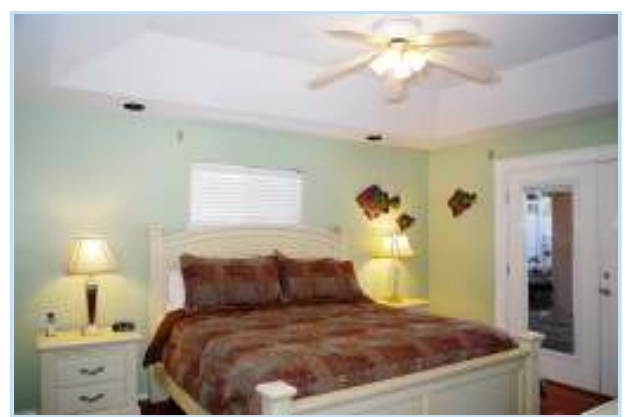
custom ceiling in master