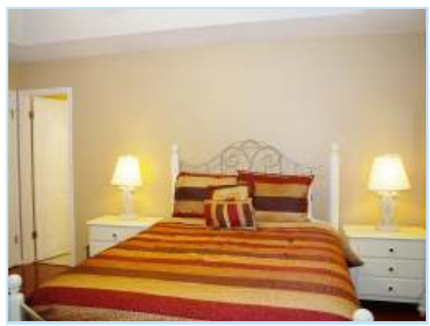
guest bedroom connects directly to guest bath