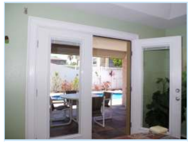
double doors lead to patio & pool