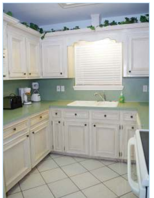
all small appliances and kitchenware included