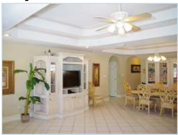
very spacious living/dining