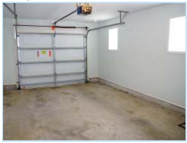
garage door opener