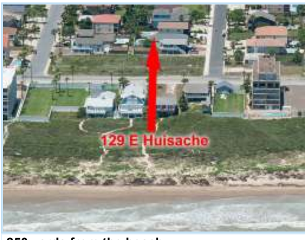
250 yards from the beach