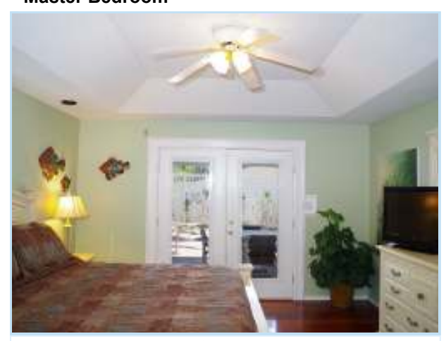
gorgeous hardwood floors