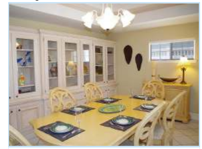
plenty of seating