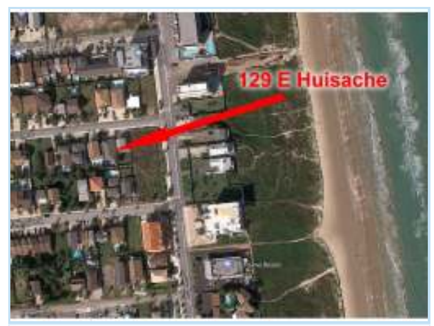
3rd lot from Gulf Blvd.