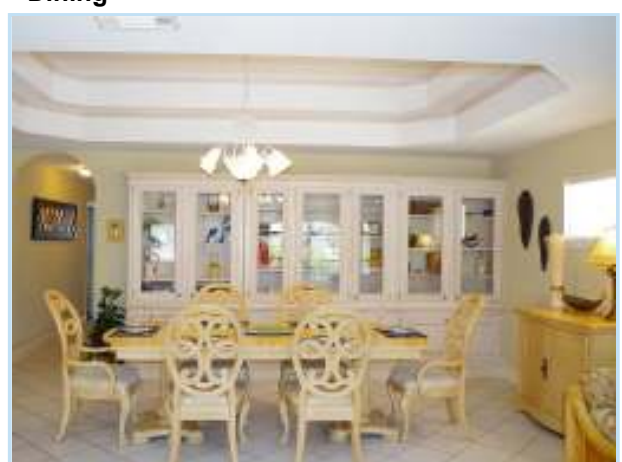
custom ceiling in dining, too