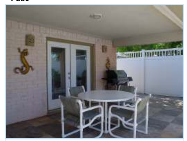
great BBQ area