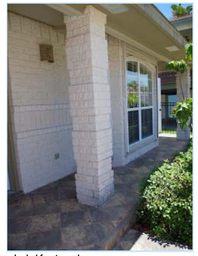
shaded front porch