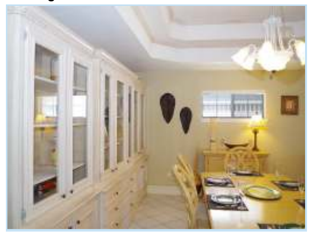
wall of built-in cabinetry