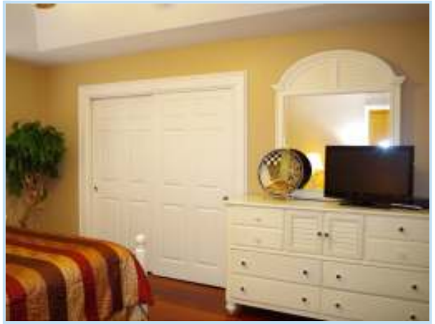
large closet and built-in shelving