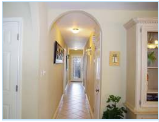
archway leads to bedrooms