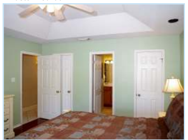
ensuite bath and 2 closets