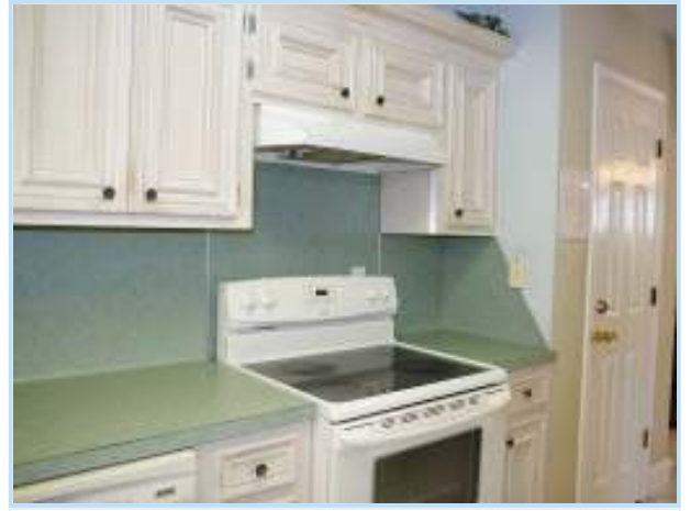
all kitchen appliances convey with sale