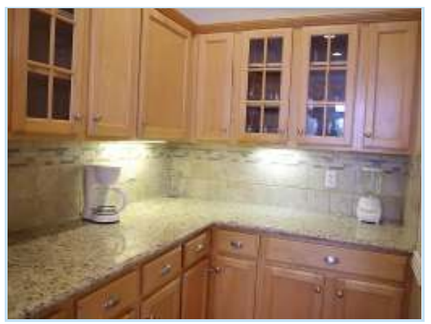
custom under-cabinet lighting