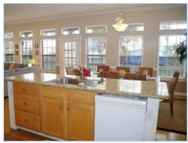
large kitchen island