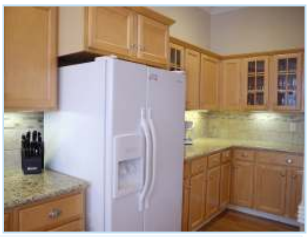
plenty of cabinet and counter space