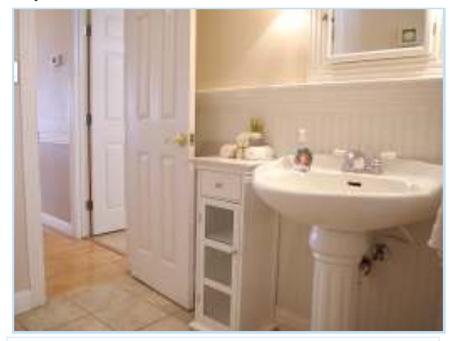
easy access to this bath from guest bedroom or hall