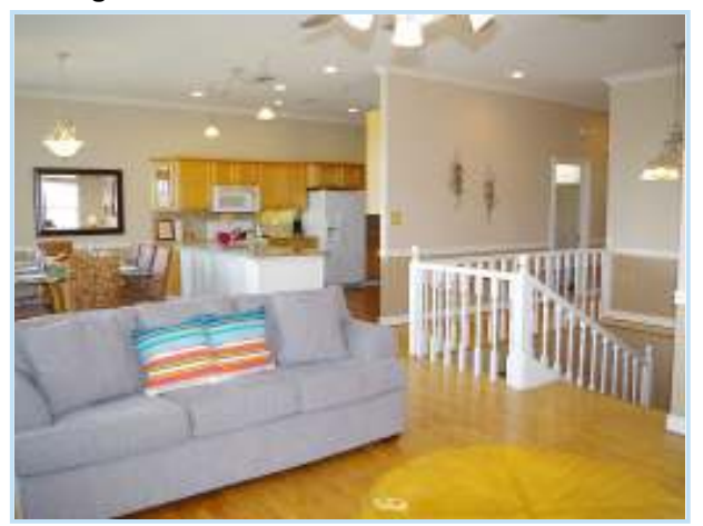
gorgeous hardwood floors on upper level