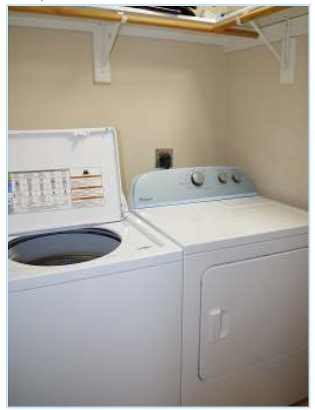
room for a full size washer and dryer