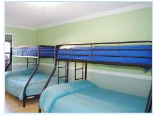
room for 6 in the "bunkroom"