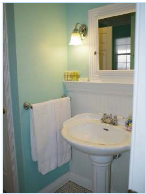
Jack and Jill bath accessible from either first floor guest bedroom