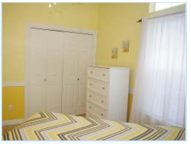
ample closet space