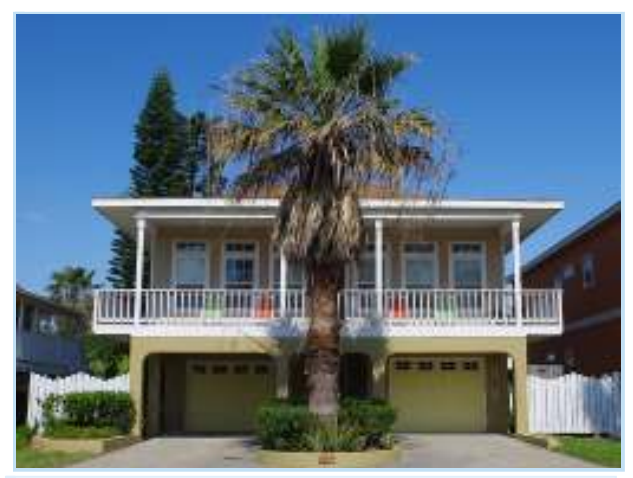
two separate 1 car garages