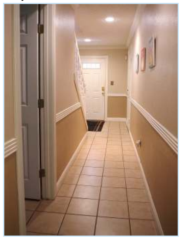
Guest Bedroom 2