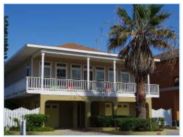
lower exterior freshly repainted