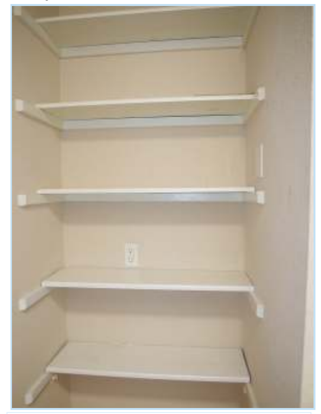
lots of storage space in utility room