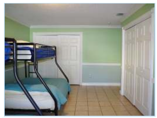
two spacious closets